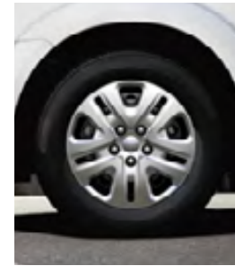
17-inch wheel cover (standard on AVP and SE; late availability)