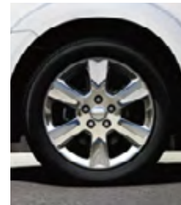
19-inch chrome-clad aluminum (optional on Crew)