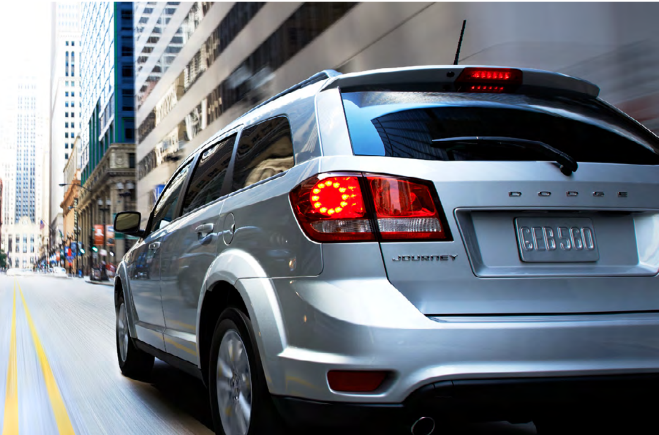
JOURNEY SXT SHOWN IN BRIGHT SILVER METALLIC.