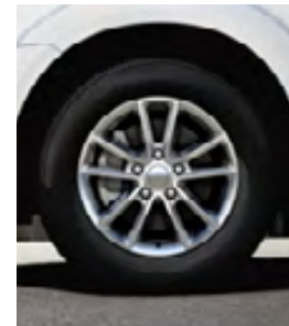
17-inch Tech Silver aluminum (standard on SXT)