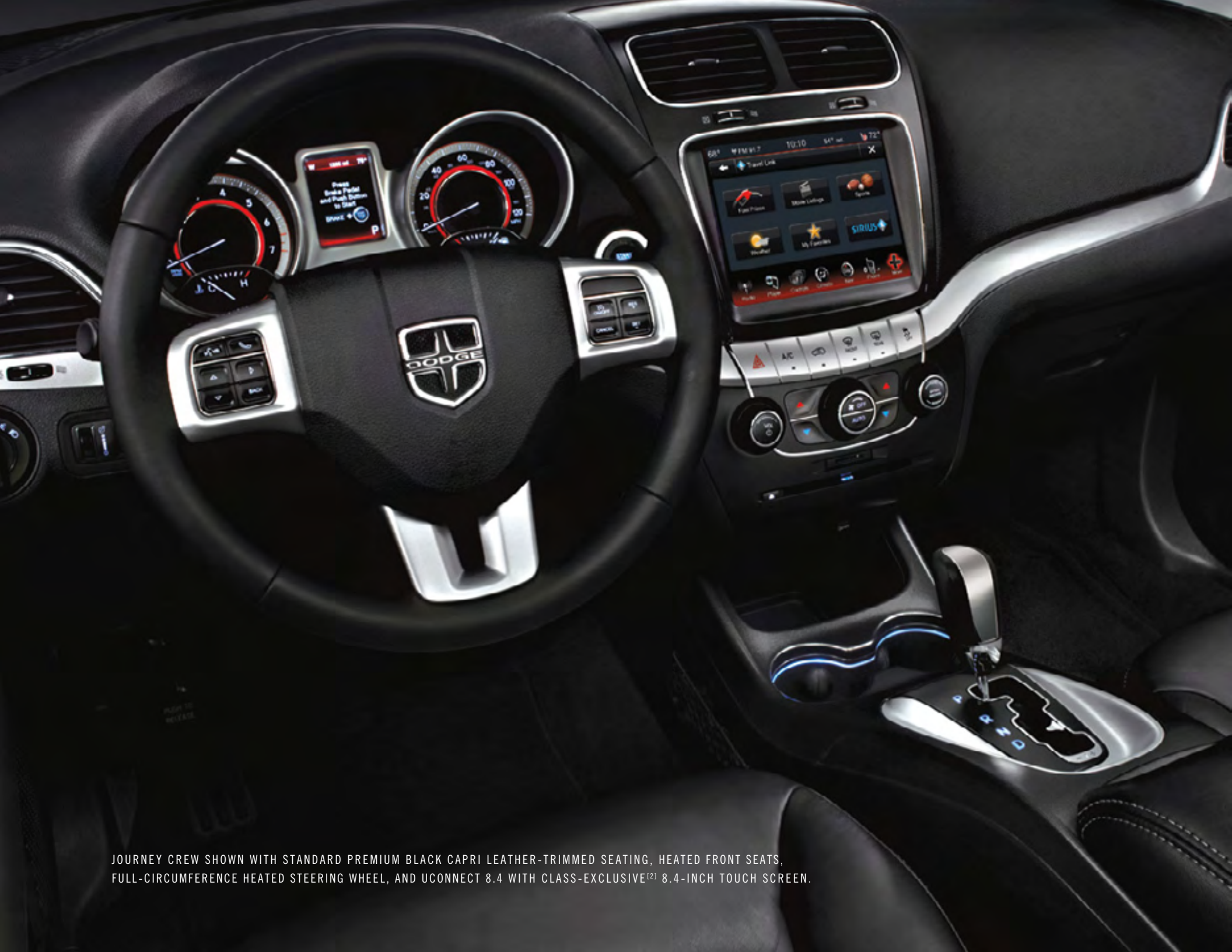
JOURNEY CREW SHOWN WITH STANDARD PREMIUM BLACK CAPRI LEATHER-TRIMMED SEATING, HEATED FRONT SEATS, FULL-CIRCUMFERENCE HEATED STEERING WHEEL, AND UCONNECT 8.4 WITH CLASS-EXCLUSIVE (2) 8.4-INCH TOUCH SCREEN.