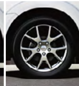
19-inch Satin Silver aluminum (standard on Crew; optional on SXT)