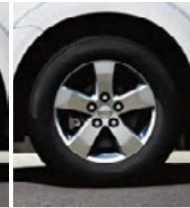
17-inch aluminum (optional on AVP and SE)