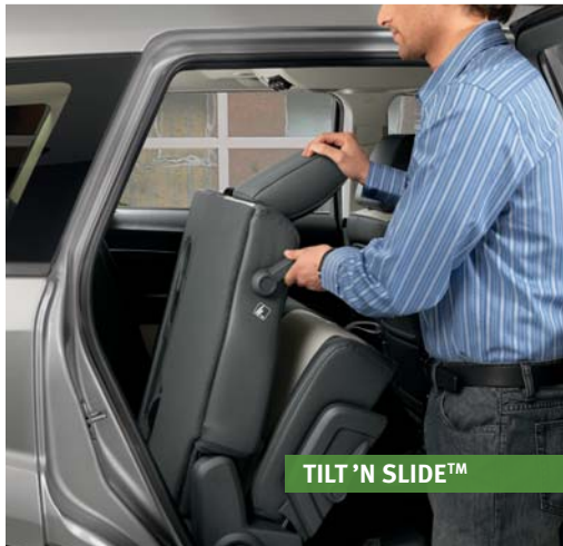
TILT 'N SLIDE™