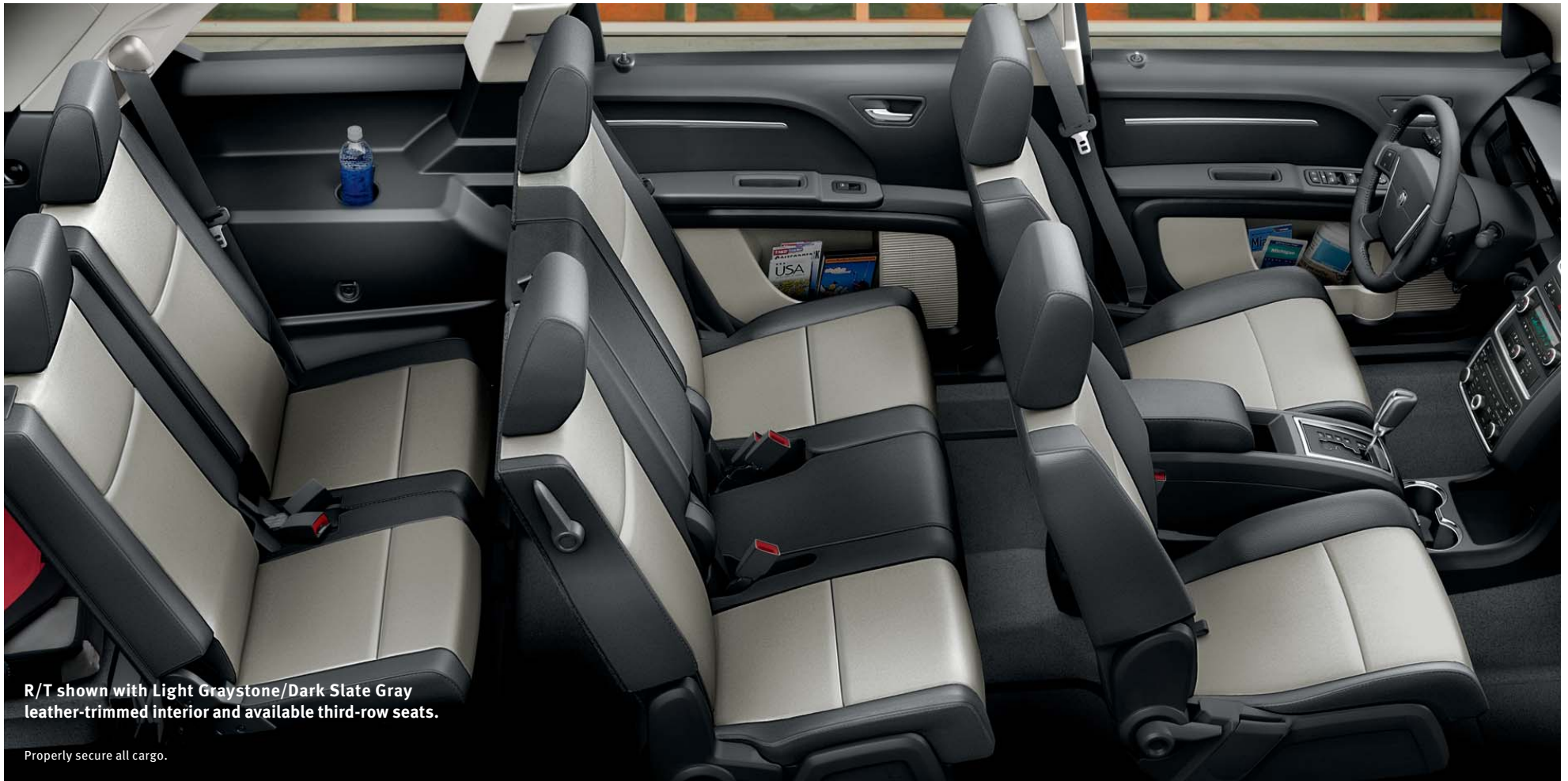
R/T shown with Light Graystone/Dark Slate Gray leather-trimmed interior and available third-row seats.