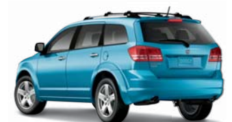
SURF BLUE PEARL [1]