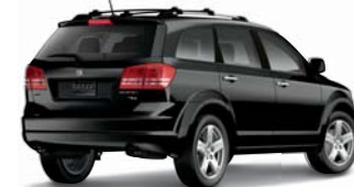
BRILLIANT BLACK CRYSTAL PEARL