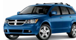
DEEP WATER BLUE PEARL