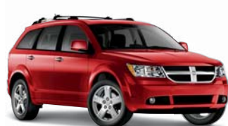
INFERNO RED CRYSTAL PEARL