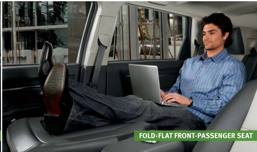
FOLD-FLAT FRONT-PASSENGER SEAT