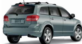
SILVER STEEL METALLIC