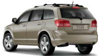
LIGHT SANDSTONE METALLIC