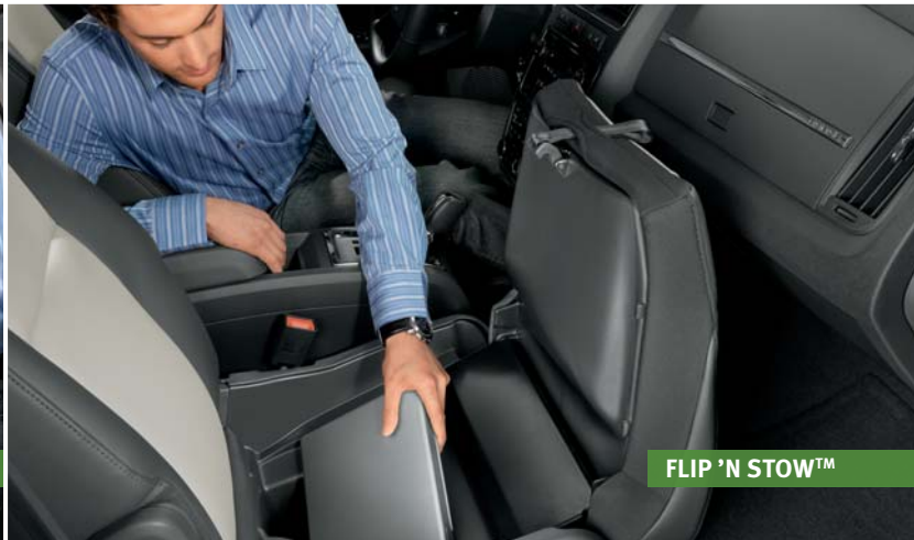
FLIP 'N STOW™