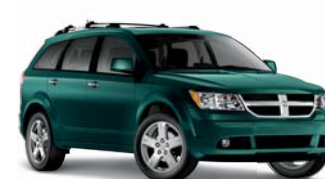
MELBOURNE GREEN PEARL