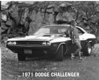
1971 DODGE CHALLENGER