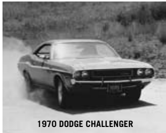
1970 DODGE CHALLENGER