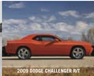
2009 DODGE CHALLENGER R/T