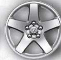
17-inch Machined-Face Aluminum. Standard on SE.