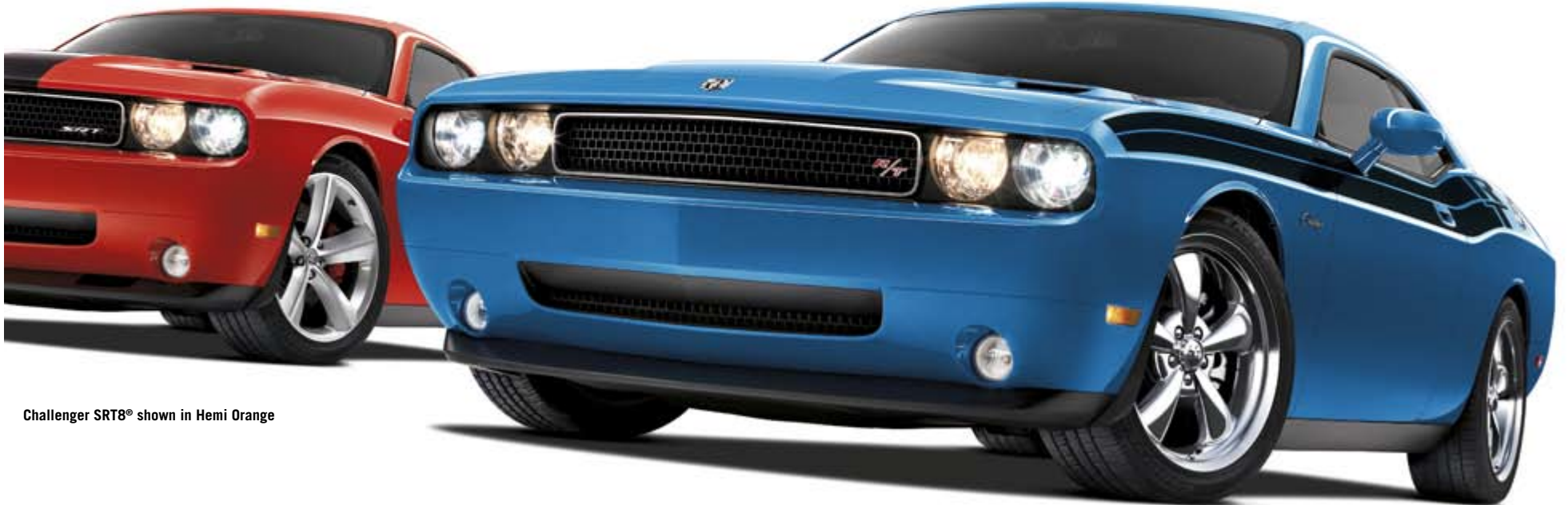
Challenger SRT8 ® shown in Hemi Orange

Those looking to offer a tribute to the 1970s' original need look no further than a Challenger R/T Classic [1] or SRT8 ® Spring Special [1] clad exclusively in B5 Blue from the Chrysler paint code archives. The R/T Classic's scripted fender badge is a nod to the sire that started it all. It features a vented performance hood that increases airflow while cooling the 5.7-liter VVT HEMI ® V8. The polished chrome 20-inch Heritage wheels may be right-now in size, but they're pure throwback in style, along with the wide-side stripe. Clad an SRT8 in B5 Blue and it will be decked with a performance hood that gives its 6.1-liter HEMI SRT ® V8 engine some breathing room. Like eye black on a lineman's cheekbones or paint on a Tomcat's nosecone, the SRT8 hood is knocked down in a matte black hood stripe and is ready for battle. Its interior, however, turns it right back up with blue accents on its performance-bolstered seatbacks.