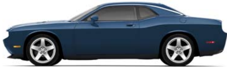
Challenger SE shown in Deep Water Blue Metallic