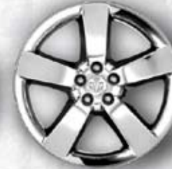
20-inch Chrome-Clad Cast Aluminum. Optional on R/T.