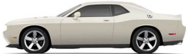
Challenger R/T shown in Stone White