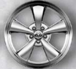
20-inch Polished Heritage. Standard on R/T Classic.