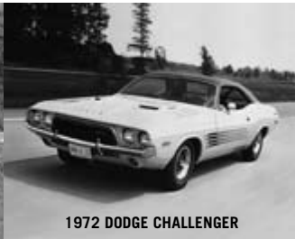
1972 DODGE CHALLENGER