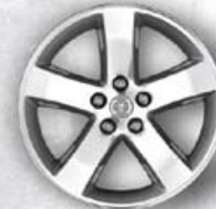
18-inch Cast Aluminum. Standard on R/T. Optional on SE.