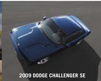
2009 DODGE CHALLENGER SE