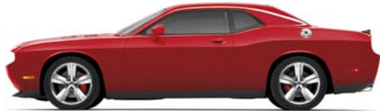
Challenger SRT8 shown in TorRed