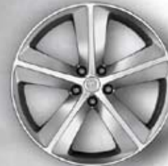
20-inch SRT® Forged Aluminum. Standard on SRT8.®