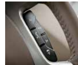
Bluetooth ®7 hands-free calling.

TECHNOLOGY GOES ALONG FOR THE RIDE Being out in the wild doesn't mean leaving creature comforts behind. You're connected and entertained with an available rear DVD entertainment system, voice recognition and a USB port 3 for your iPod. 4 Available SiriusXM NavTraffic 5 offers detailed traffic updates that are displayed on the available navigation radio's 6 2-D or 3-D full-color map. Meanwhile, SiriusXM Satellite Radio 5 (with 3-month trial) lets you enjoy commercial-free music channels, talk, news, comedy and family programming.