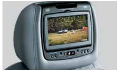
Head Restraint DVD System