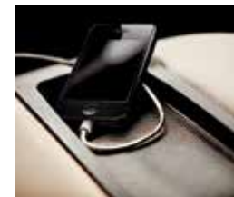
USB connectivity 3