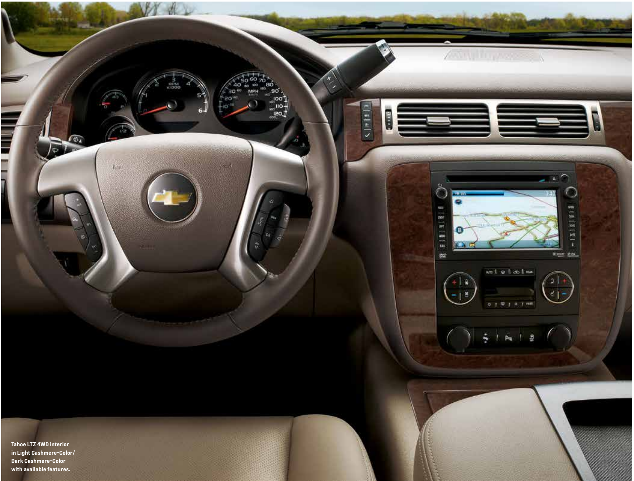
Tahoe LTZ 4WD interior in Light Cashmere-Color/ Dark Cashmere-Color with available features.