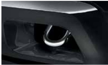
Chrome Tow Hook