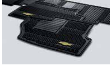
All-Weather Premium Floor Mats