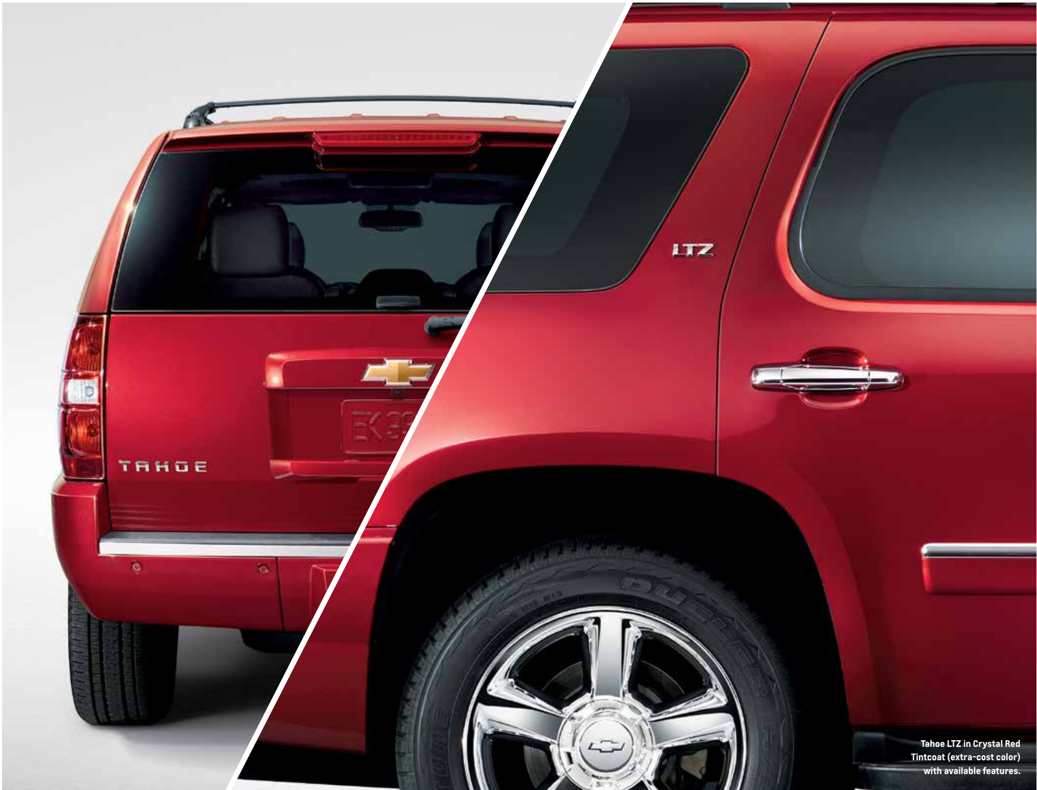
Tahoe LTZ in Crystal Red Tintcoat (extra-cost color) with available features.