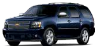
CONCORD METALLIC 1,2,3