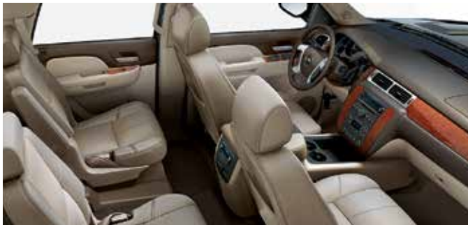
Ebony Premium Cloth 1