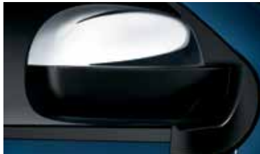
Outside Rearview Mirror Covers