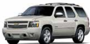
CHAMPAGNE SILVER METALLIC 2