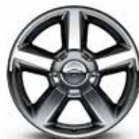
20" Chrome-Aluminum (Available on LTZ)