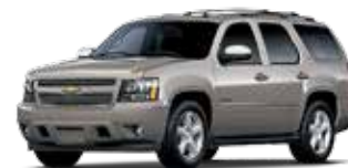
MOCHA STEEL METALLIC