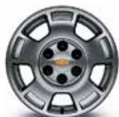
17" Aluminum (Standard on LS and LT)