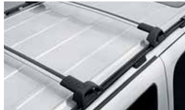
Roof Rack Cross Rail Package