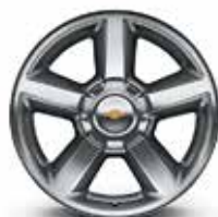
20" Polished-Aluminum (Standard on LTZ; available on LS and LT)