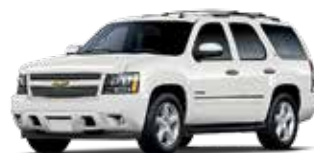
WHITE DIAMOND TRICOAT 1,2,4