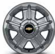
18" Aluminum (Available on LT; requires available Z71 Off-Road Suspension Package)