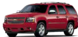
CRYSTAL RED TINTCOAT 1