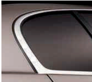
CAR OPPOSITE: EXTERIOR – BLUE CRYSTAL