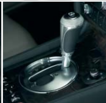
THE MULLINER DRIVING SPECIFICATION Clockwise: Dark Stained Burr Walnut veneer, embroidered Bentley emblem to seat facings, diamond quilted hide to door panels, sporting gear lever, drilled alloy sport foot-pedals, 20" 2-piece alloy sports wheels.