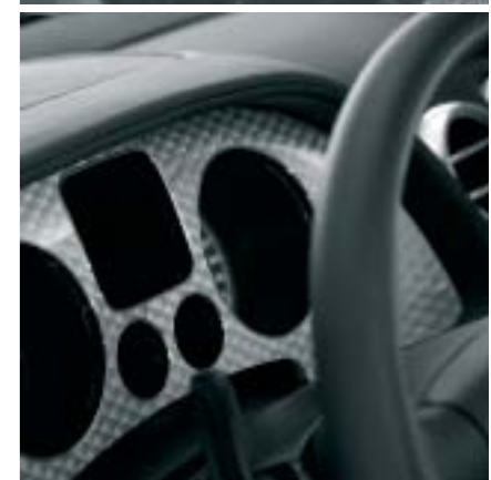
Top: Mulliner alloy fuel filler cap Centre: Lambswool rugs Bottom: Aluminium fascia panel