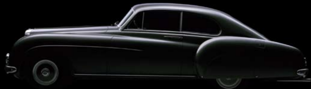
R-TYPE CONTINENTAL, 1952.