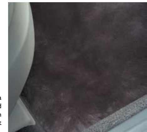
Top: Aluminium fascia Centre: Embossed Bentley emblem Bottom: Deep-pile carpet mat with hide trimming.