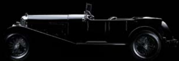
SPEED SIX, 1928.