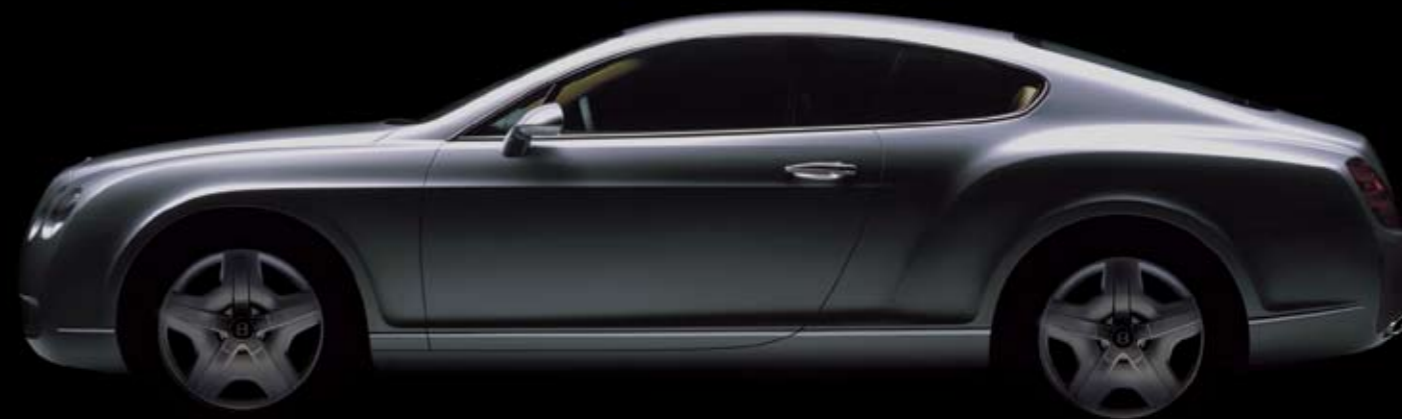
CONTINENTAL GT, 2003.