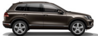
Black Oak Brown Metallic POPO