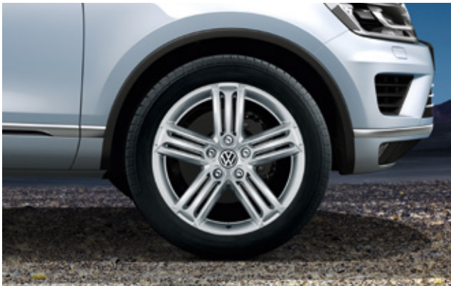
20" Sterling Silver painted Talladega alloy wheels.

Inspired by the adventurous spirit within, the R-Line package captures the essence of individuality. 20" Talladega alloy wheels support an aggressive stance, while dramatic lines trace the front and rear bumpers in true "R" style. Extended side sills with the expressive rectangular, twin chrome-plated tailpipes conclude the rear. A multifunctional leather steering wheel with R-Line logo and Tipshift paddles and an aluminium painted centre console articulates the New Touareg's athletic nature, while "Silver Lane" inserts adorn the dash, door panels and centre console.