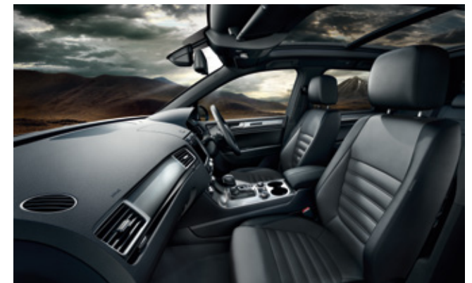
'Silver Lane' insert on dash, door panels and centre console.