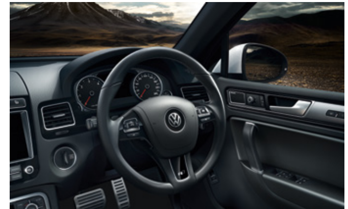
Heated leather-covered multifunctional steering wheel with Tipshift paddles and R-line logo.

The figures reflected were obtained in accordance with prescribed uniform measuring standards (SANS 20101: 2006 / ECE R101: 2005 in their currently applicable versions) under laboratory type conditions. The measuring standards are stipulated by law. They do not apply to a specific vehicle and are provided to enable comparison between different vehicle models tested using the same uniform measuring standard. The values are accordingly not necessarily representative of real-life driving conditions. Factors such as driving style, vehicle load, road conditions, tyre size, traffic and ambient conditions may result in different fuel consumption and carbon dioxide emission levels to those achieved under the test parameters referred to above. More details are contained in the owner's manual.