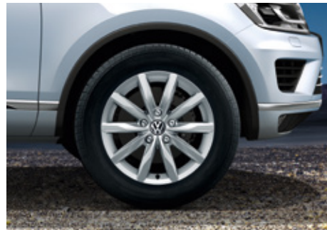
18" Arica alloy wheel (255/55 R18) Standard on Luxury and Escape