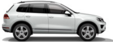
Pure White Non-Metallic 0Q0Q

The illustrations on this page can only be regarded as a general guide as the printing process cannot render the true depth and brilliance of the paint finishes with absolute accuracy. Please note that certain paint and trim combinations may not be available.