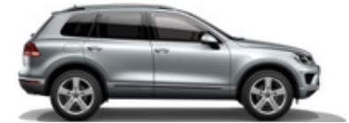
Light Silver Metallic 8E8E