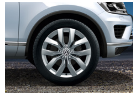
20" Musafi alloy wheel (275/45 R20) Optional on Executive