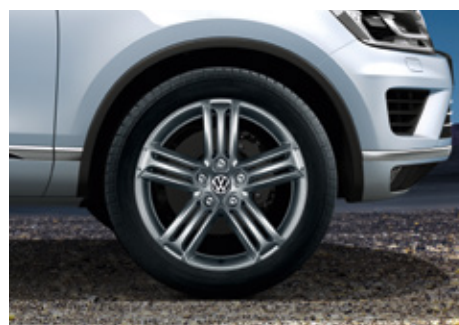
20" Talladega alloy wheel (275/45 R20) Standard on R-line package