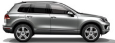
Tungsten Silver Metallic K5K5