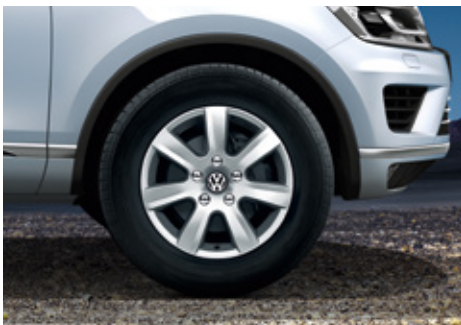
17" Sonora alloy wheel (235/65 R17) Standard on Elegance