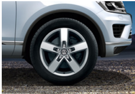
19" Everest alloy wheel (265/50 R19) Standard on Executive