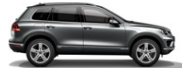
Canyon Grey Metallic 9Q9Q