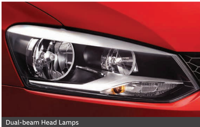
Dual-beam Head Lamps