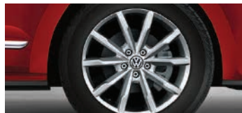
R15 'Portago' Alloys