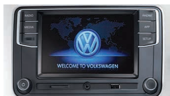
Touchscreen Infotainment System

The Auto-dimming IRVM dims out any glare from vehicles that trail behind to save your eyes from strain. The Climatronic automatic air-conditioning, along with the cooled glovebox, makes sure that all passengers have a comfortable journey, no matter what the temperature is outside. Now, nothing can stop you from being in your element with the Polo.