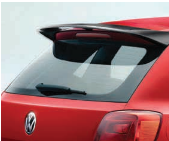
Heat Insulated Glass