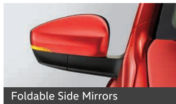
Foldable Side Mirrors