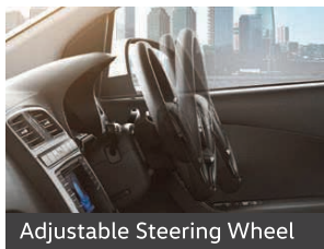
Adjustable Steering Wheel

Get ready to be awed every time you enter the Polo's black cabin accentuated with chrome accents. Sink into the stylish upholstered seats, while the ambient lighting with theatre dimming effect, sets the mood. The Leather-wrapped Steering Wheel feels as elegant and smooth to the hand as it is to handle, and comes with a brushed-aluminium finish that adds just the right amount of class to it.