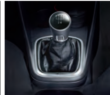
5-speed Manual Transmission