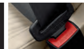
3-point Seat Belts