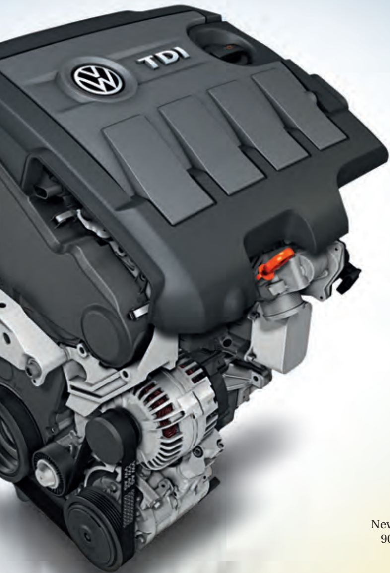
New 1.5L TDI Engine 90PS (66kW) Power 230 Nm Torque