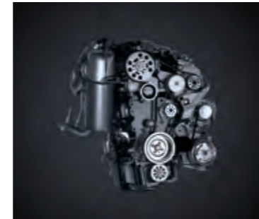
1.2L MPI Petrol Engine