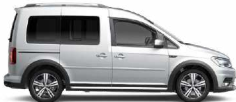
Reflex Silver Metallic