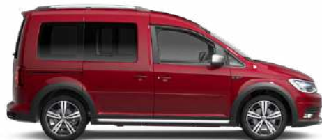
Fortana Red Metallic