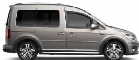
Mojave Beige Metallic