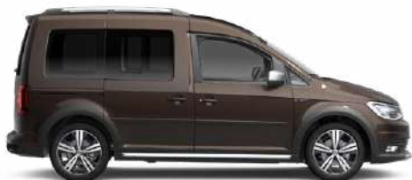
Chestnut Brown Metallic