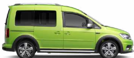
Viper Green Metallic