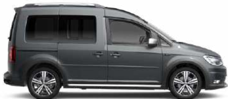
Indium Grey Metallic