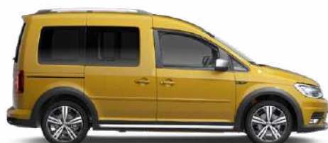
Sandstorm Yellow Metallic