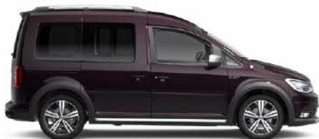
Black Berry Metallic