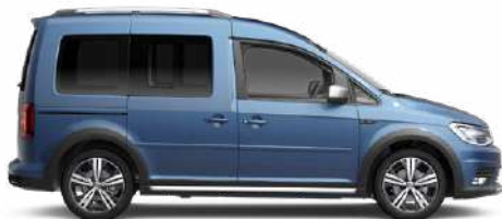
Acapulco Blue Metallic