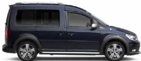
Starlight Blue Metallic