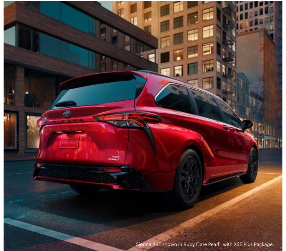
Sienna XSE shown in Ruby Flare Pearl 1 with XSE Plus Package.