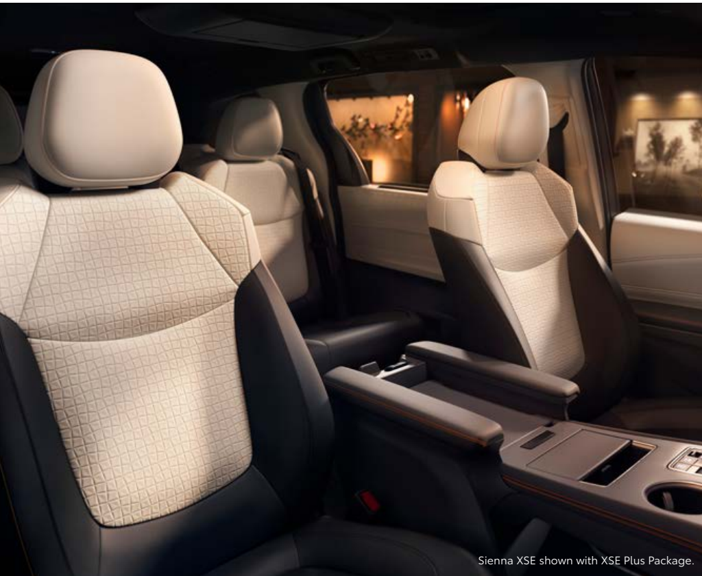
Sienna XSE shown with XSE Plus Package.