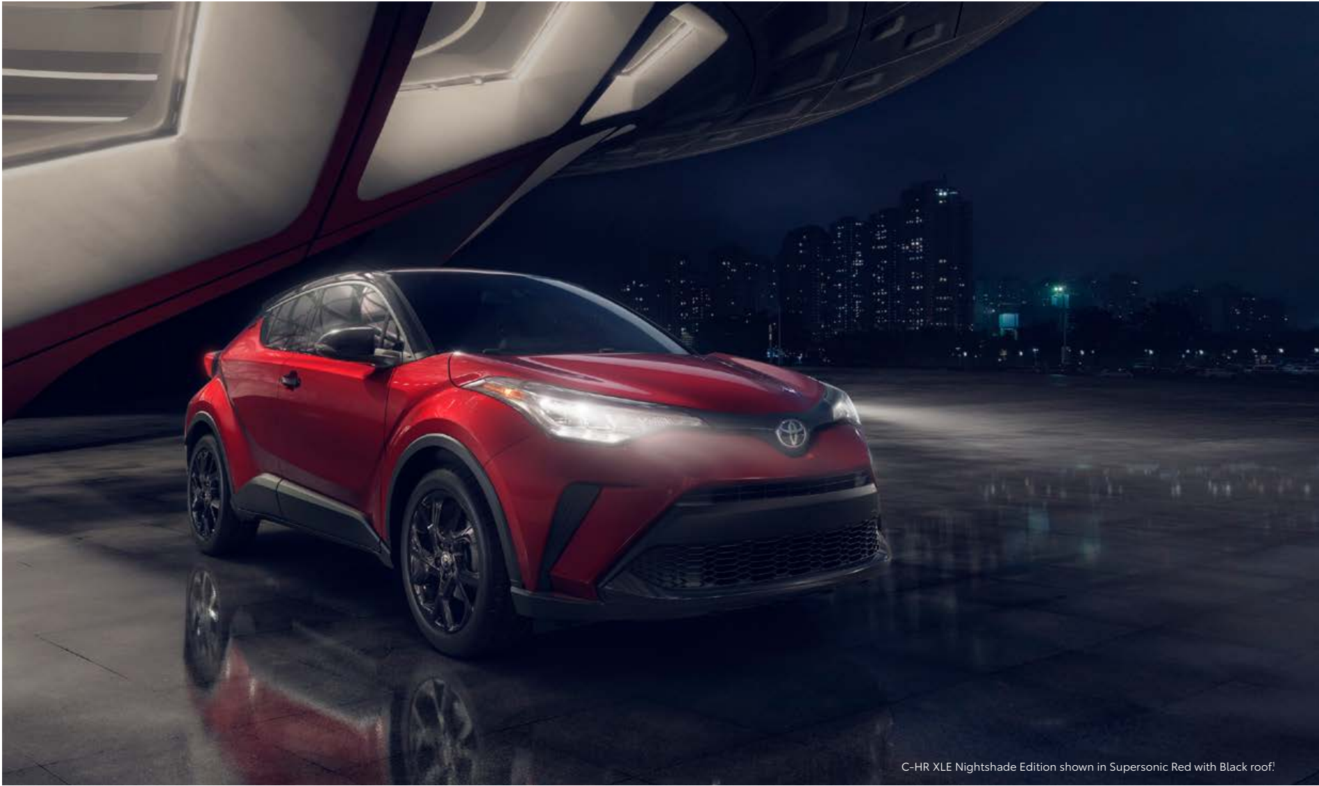
C-HR XLE Nightshade Edition shown in Supersonic Red with Black roof.*