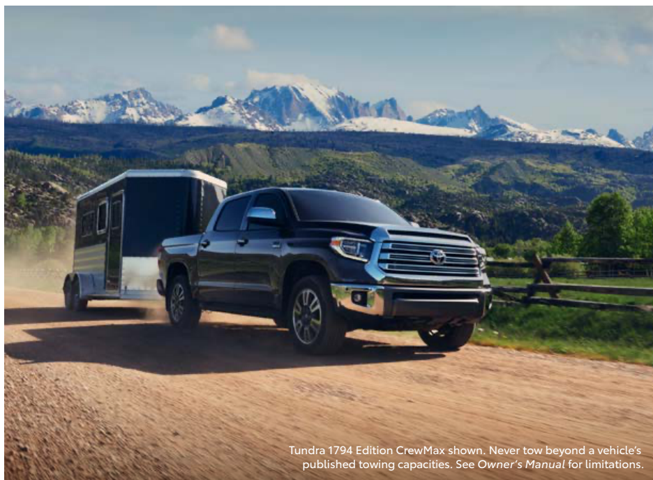
Tundra 1794 Edition CrewMax shown. Never tow beyond a vehicle's published towing capacities. See Owner's Manual for limitations.