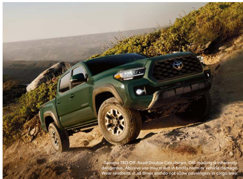
Tacoma TRD Off-Road Double Cab shown. Off-roading is inherently dangerous. Abusive use may result in bodily harm or vehicle damage. Wear seatbelts at all times and do not allow passengers in cargo area.