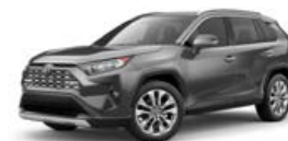
CROSSOVERS & SUVs