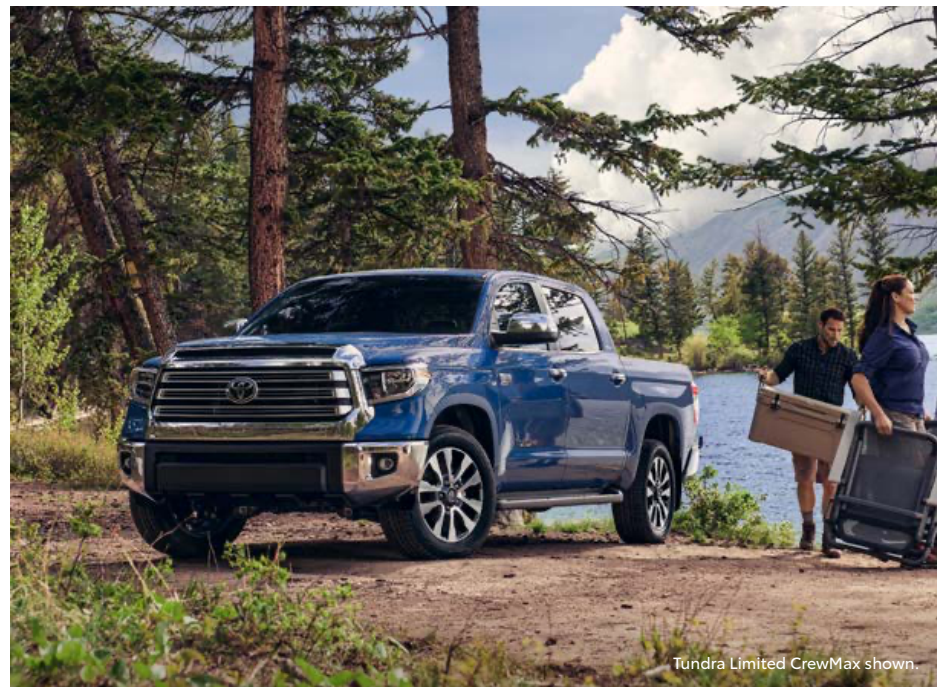
Tundra Limited CrewMax shown.

Tacoma and Tundra are built to climb hills and run long. Play harder than ever before with a truck capable of conquering the earth.