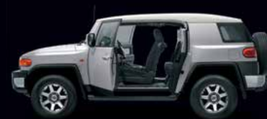
Rear-hinged door design

Street cred. Check! The FJ's style isn't just skin-deep, the look outside is perfectly coordinated with the look inside – the interior colour panels match the exterior body colour. The overall impression is bold and confident.