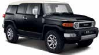
2KC ONYX BLACK METALLIC