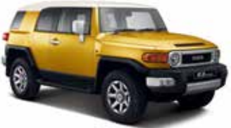
5A3 YELLOW AND WHITE

The FJ Sport Cruiser is available in 2KC Onyx Black Metallic only.