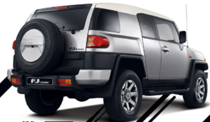
FJ Cruiser shown