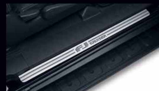
FJ Cruiser scuff plates (FJ Sport Cruiser)