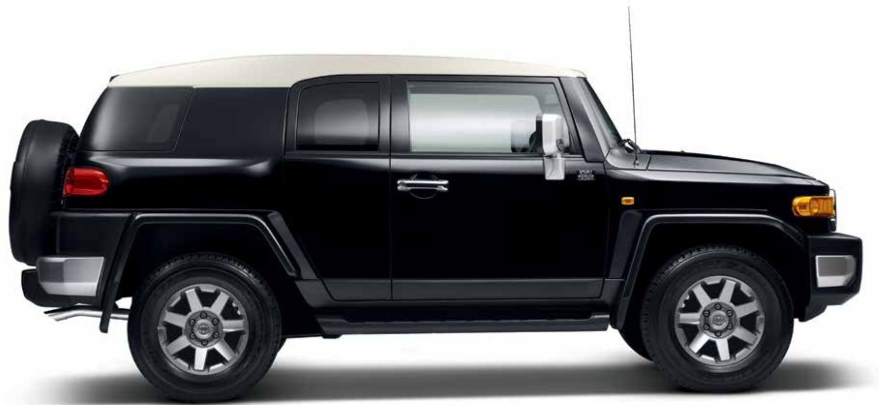
FJ Sport Cruiser shown