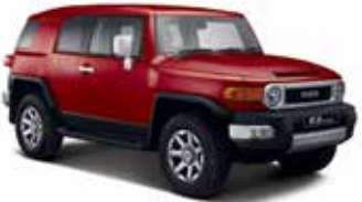
3LS RED MONOTONE