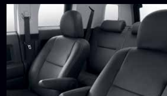
Black combination leather interior (FJ Sport Cruiser)