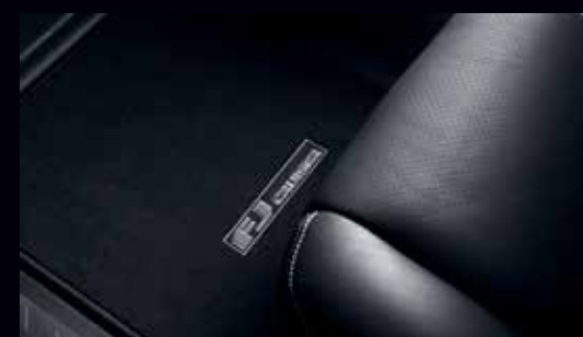
Carpet set (FJ Sport Cruiser)