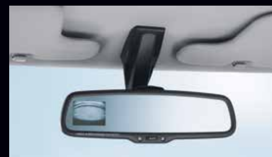
Rear view mirror with built-in reverse monitor