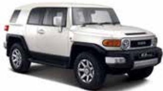
058 IVORY WHITE