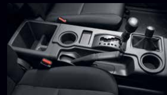
Centre console with convenient storage spaces