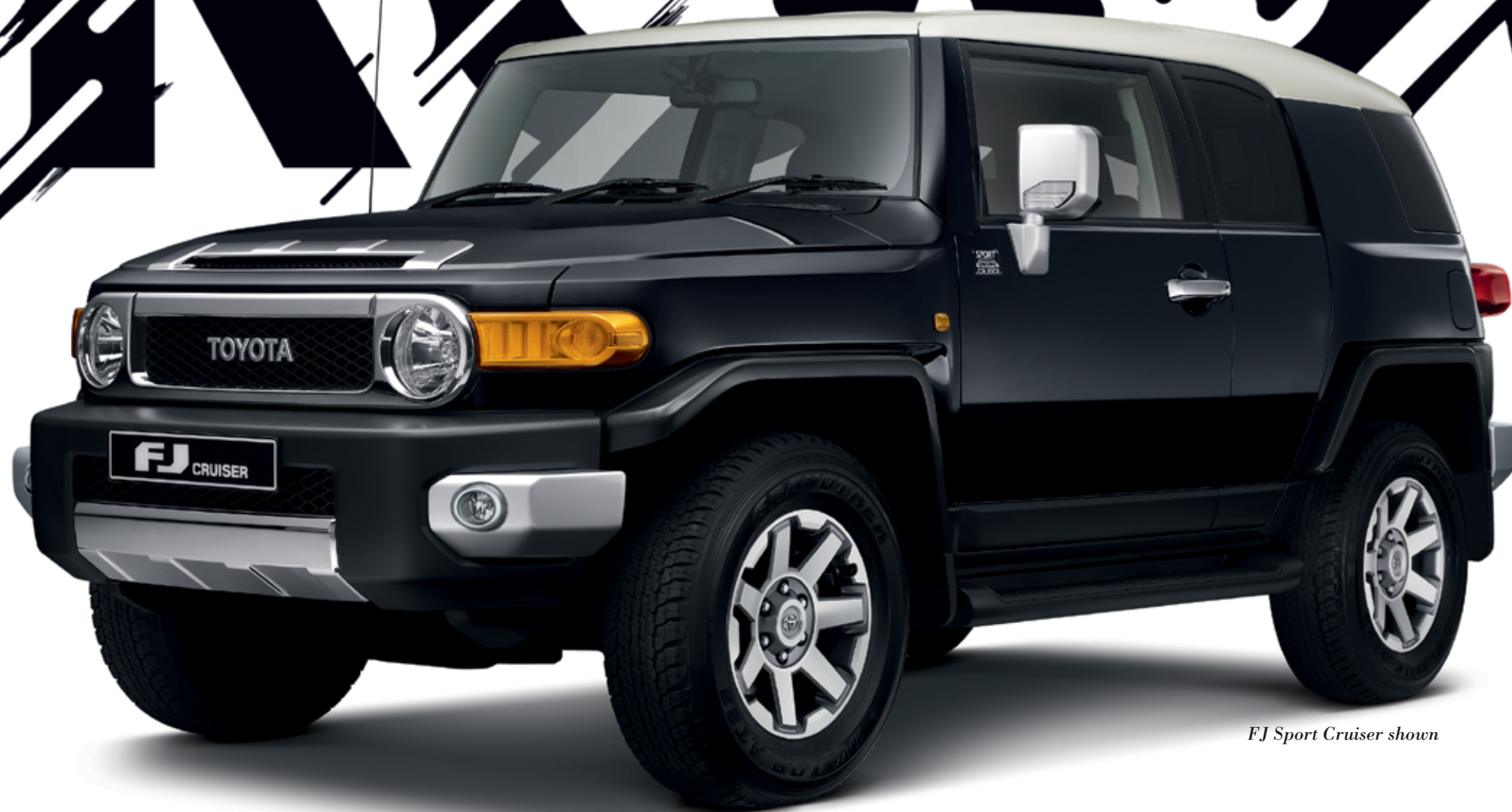
FJ Sport Cruiser shown

The exterior design has an unapologetic, bold extroverted look. The FJ has a wild side, a rogue in the city yet confident off-road. Modern yet retro, the FJ's unique styling demands a unique driver who's not afraid to break the rules.