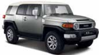
2KY CEMENT GREY