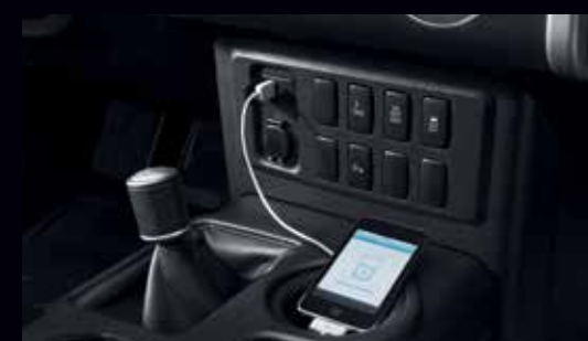
USB and iPod inputs