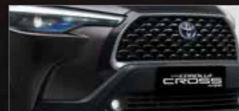
Bold Front Grille Design. With double trapezoid shape on the grille to highlight the toughness element of the car. (All Type)