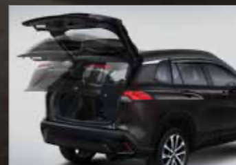
Automatic Power Back Door. Equipped with kick sensor feature to make it more convenient when loading into the trunk. (HV Type)

Hybrid engine and battery power work seamlessly to enhance a smooth driving experience and maximum performance to let you conquer every journey.