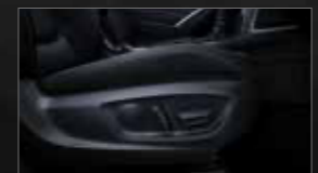
Electric Power Seat. An easy 6-way position adjuster for the driver to aim for the best convenient position. (HV Type)