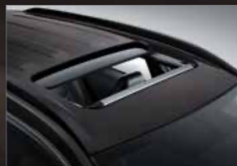
Power Moonroof. Providing sufficient lighting in the cabin to give a spacious feeling. (All Type)