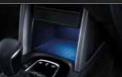
Illuminating Console. Not only providing a luxurious addition to the interior but also giving better visibility to the center console. (All Type)