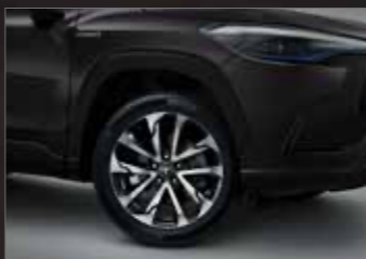
18" Alloy Wheel. New design with machining and dark grey chrome color providing a more urban look. (All Type)