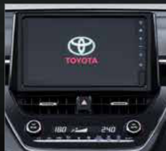
Multi-Purpose Head Unit. New 9" Display with AM/FM Stereo, Bluetooth, Miracast, NFC and Voice Command.