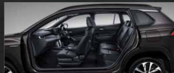
Comfortable Cabin Space Designed and calculated flawlessly to give a decent leg room and high ceiling for an enjoyable driving experience. (All Type)