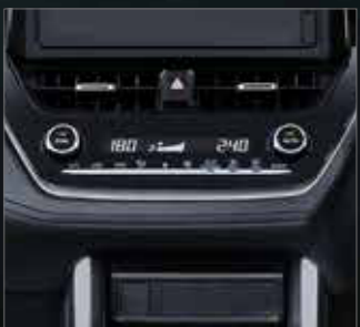
Dual Zone With Auto Function Convenient AC adjustment as the driver and passengers preferences. (All Type)