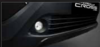
Beaming LED Foglamp. Giving a solid visibility for a comfortable and safe driving experience. (All Type)