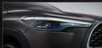
Sharp Headlamp Design. Enhancing the sleek yet premium look of the front part of the car. (HV Type)