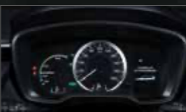
Detailed MID and Combi Meter Design. With digital MID for a more comprehensive outlook on the vehicle's status. (HV Type)