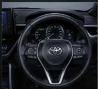
Elegant Steering Wheel Design. Embellished with silver chrome details to give a more prestigious experience when commanding the road. (All Type)