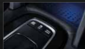
Advanced Drive Mode. Enjoy the journey as you experience ECO, Sport or EV. (HV Type)