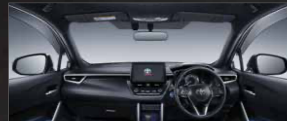
Classy Interior Design With elegant black color and silver chrome details placed meticulously to further enhance the luxurious feeling on the inside of the car. (All Type)