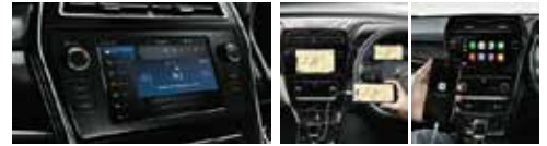
8" smart audio system with rear view camera display Google Android Auto and Apple CarPlay