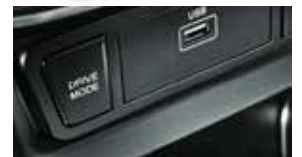
Smart driving modes