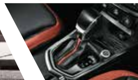
AISIN 6-speed automatic transmission

Max Power 129hp/4,000rpm Max Torque (with AT) 324Nm/1,500~2,500rpm