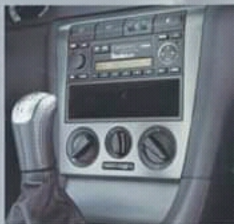
Inspired by the aviation cockpit: central console in BLACK DOT design.