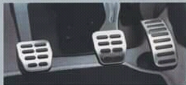
Forward your feet for a lifetime of carrying you around: the Octavia RS has stainless steel pedals and woven textile mats with integral sports emblems.