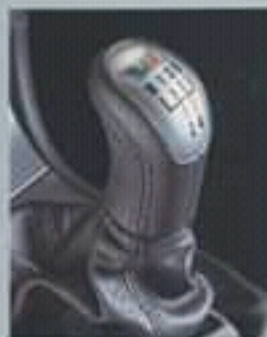
Hands-on comfort and style: gearstick knob with sports emblem and gearshift sleeve made from fine nubuck leather.

for instance, is made from fine nubuck leather and the gearstick knob with sports emblem and gearshift sleeve made from fine nubuck leather. The cockpit's central instrument console is finished in an all-over BLACK DOT design, and the door trim naturally mirrors the colour of the seats. In all, the Octavia RS proves that sportiness and comfort are anything but incompatible.