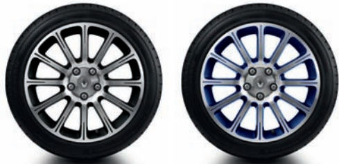
17" BEBOP BLACK DIAMOND-FINISH RIMS

CO = CLEARCOAT OPAQUE COLOUR; CP = CLEARCOAT PEARLESCENT COLOUR; SEC = SPECIAL-EFFECT COLOURS