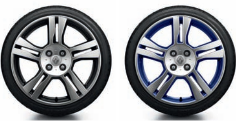
17" CUP BLACK DIAMOND-FINISH RIMS