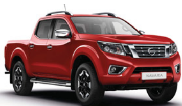
FLAME RED (S)