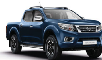
CAYMAN BLUE (M)