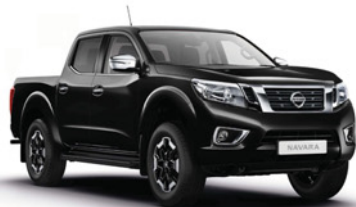
METALLIC BLACK (M)