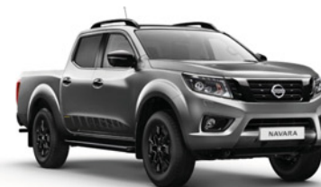
TWILIGHT GREY (M)