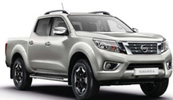
STARBURST SILVER (M)