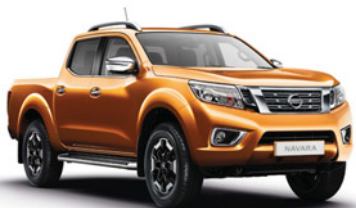
SAVANNAH YELLOW (M)