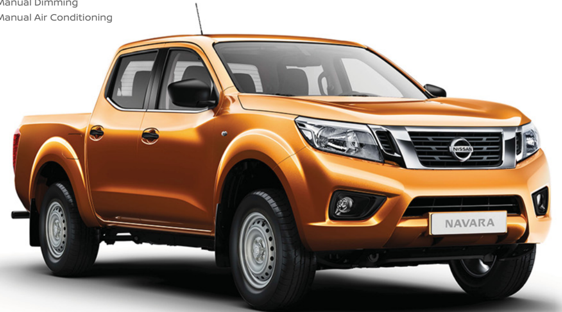
Image shown in Navara Visia Double Cab.