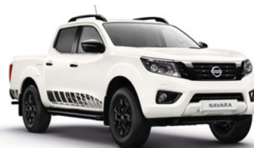
STORM WHITE (P)