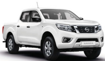
ALABASTER WHITE (S)

(S) = Solid (M) = Metallic (cost option) (P) = Pearlescent (cost option)