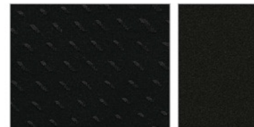
N-CONNECTA PREMIUM GRAPHITE CLOTH