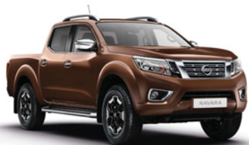
EARTH BRONZE (M)