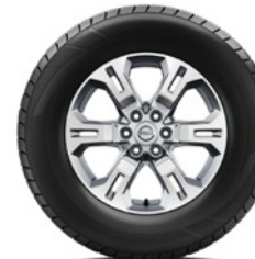
ACENTA 17" ALLOY WHEELS