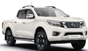
STORM WHITE (P)*