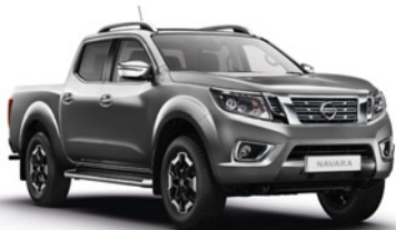
TWILIGHT GREY (M)