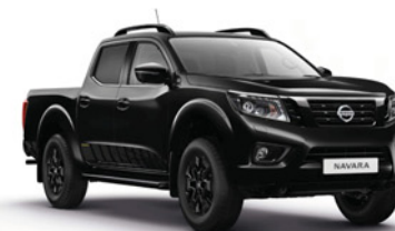
METALLIC BLACK (M)