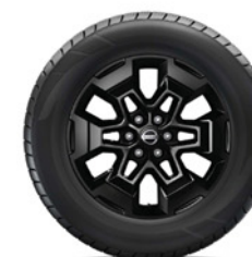
N-GUARD 18" BLACK ALLOY WHEELS

*Storm White available as a chargeable option on N-Connecta and Tekna grade, standard on N-Guard.