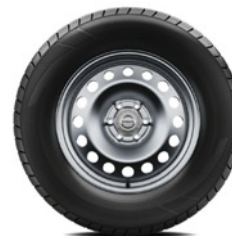
VISIA 17" STEEL WHEELS