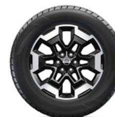
N-CONNECTA and TEKNA 18" ALLOY WHEELS