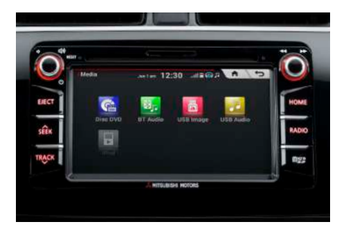
Multifunction GPS Navigation (SMARTPHONE-LINK) [MGN]*

The MGN system is accessible via 6.5" WVGA (800 x 480) LCD and DVD deck mounted in the centre console. Through large ergonomic touch screen buttons, MGN offers a wide variety of smartphone connectivity solutions and navigation map data for countries throughout Europe.