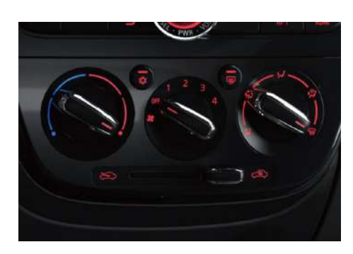
Air conditioning, manual with pollen filter

Vehicle speed is automatically maintained without keeping your foot on the accelerator pedal, allowing more relaxed driving on extended journeys. Pressing the brake pedal disengages the system.