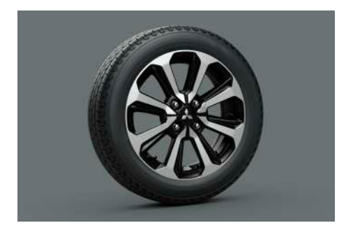
175/55R15 tyres + 15-inch alloy wheels