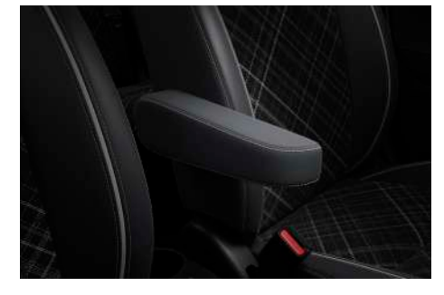
Driver's seat adjustable armrest

The MGN system is accessible via 6.5" WVGA (800 x 480) LCD and DVD deck mounted in the centre console. Through large ergonomic touch screen buttons, MGN offers a wide variety of smartphone connectivity solutions and navigation map data for countries throughout Europe.