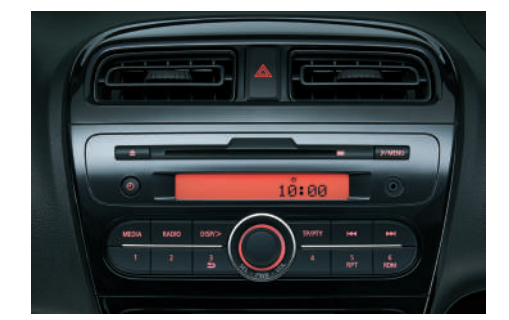
CD player with AUX terminal and unique type centre panel