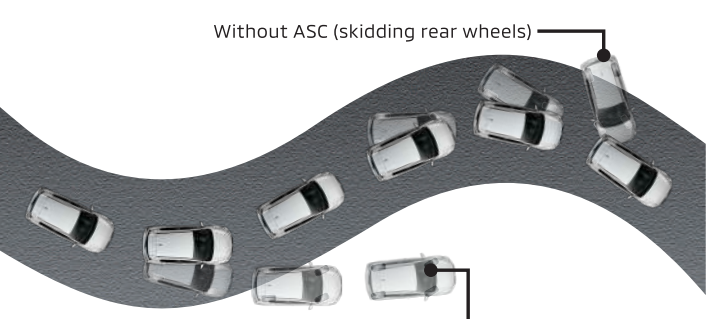
Without ASC (skidding front wheels)

Pretensioners automatically tighten the front seatbelts in the event of a collision to help restrain the driver and front passenger.