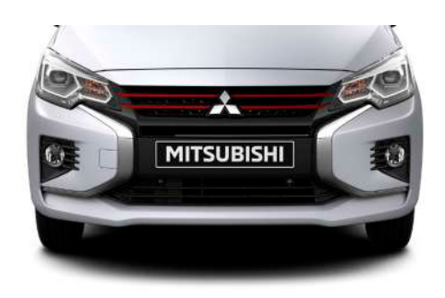
Front grille accents with red accent