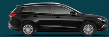
BLACK PEARL metallic paint