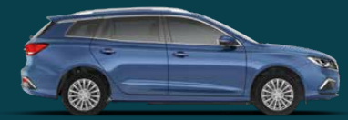
PICCADILLY BLUE metallic paint