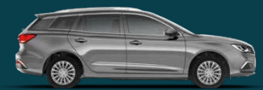
WESTMINSTER SILVER metallic paint