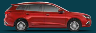
DYNAMIC RED tri-coat paint

Tri-Coat and metallic paint optional at extra cost.