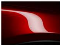
Soul Red Crystal