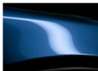
Deep Crystal Blue