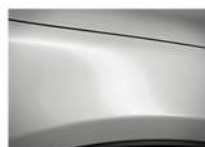
Snowflake White Pearl