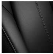
Premium Black Leather