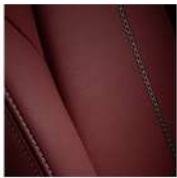
Red Nappa Leather