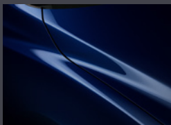
Deep Crystal Blue