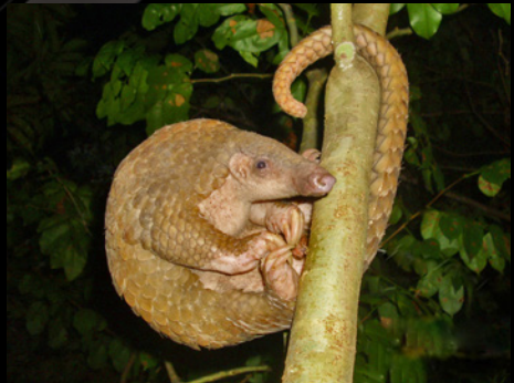
Katala Foundation Inc.

The BT-50 Pangolin is Mazda's tribute to the Philippine Pangolin, which is endemic to our country and is found in the Palawan region.