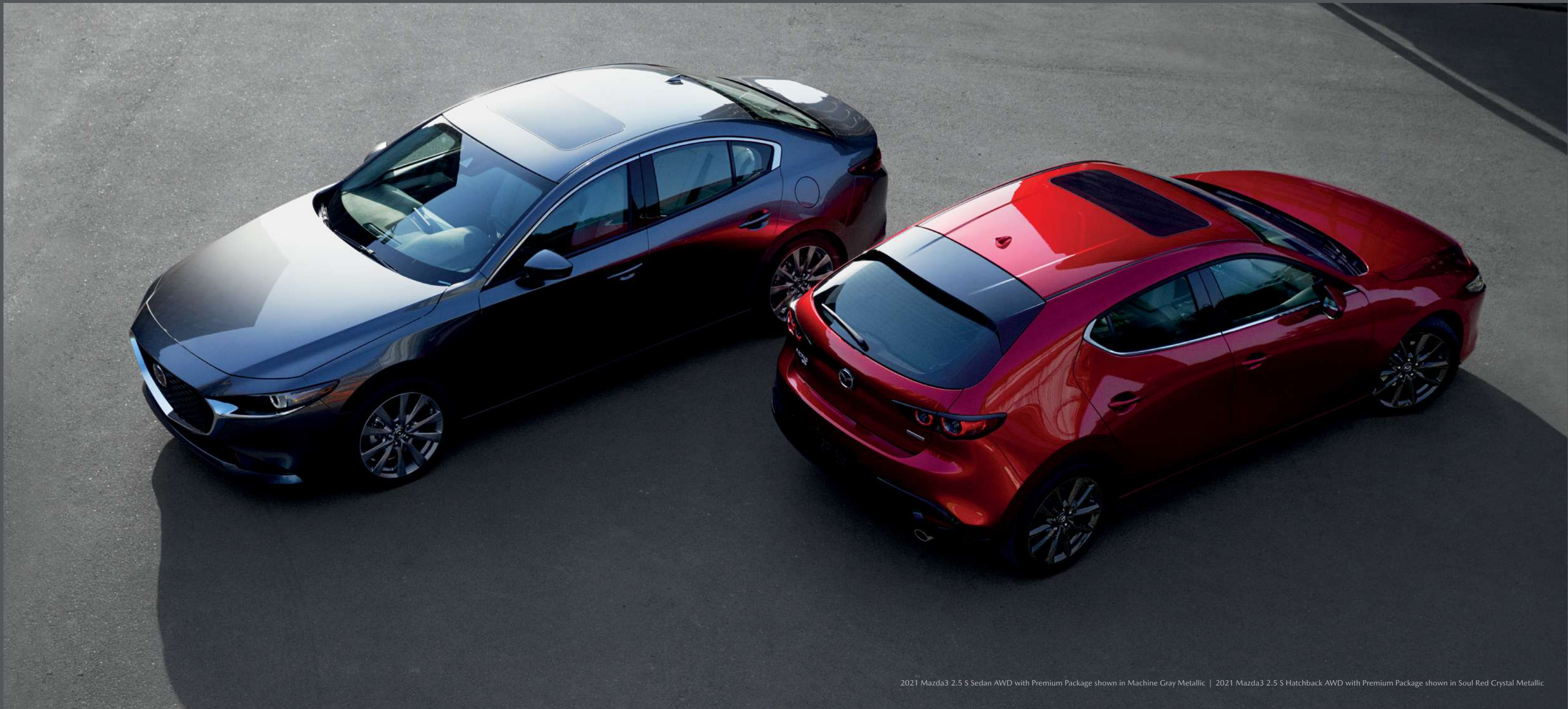
2021 Mazda3 2.5 S Sedan AWD with Premium Package shown in Machine Gray Metallic | 2021 Mazda3 2.5 S Hatchback AWD with Premium Package shown in Soul Red Crystal Metallic