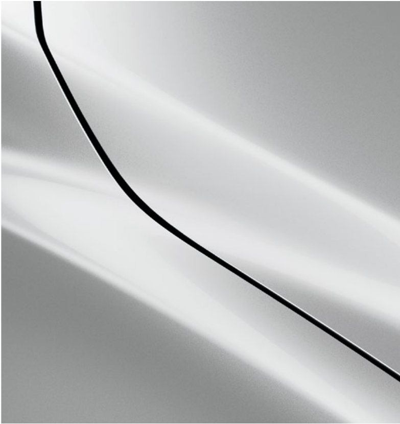
Sonic Silver Metallic