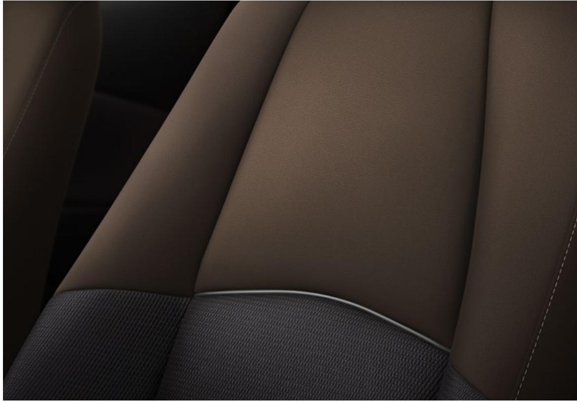
Brown/black cloth (G15 Pure)

To maintain the feeling of considered design throughout the cabin, luxurious materials from the seats adorn the door trims and centre dashboard. Beautiful to touch and to admire, these trims create a stylish, fresh ambience that speaks to New Mazda2's modern styling.