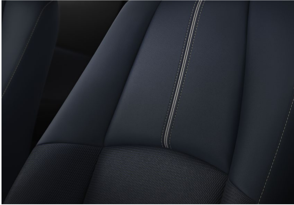
Navy blue/black cloth (G15 Evolve)