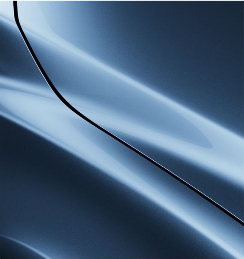
Eternal Blue Mica