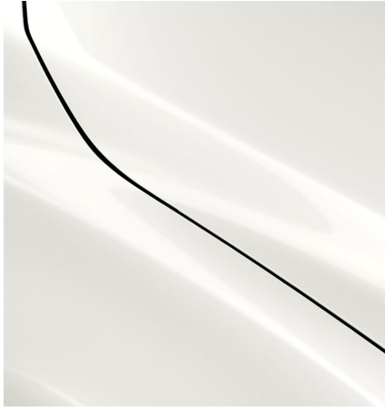
Snowflake White Pearl Mica