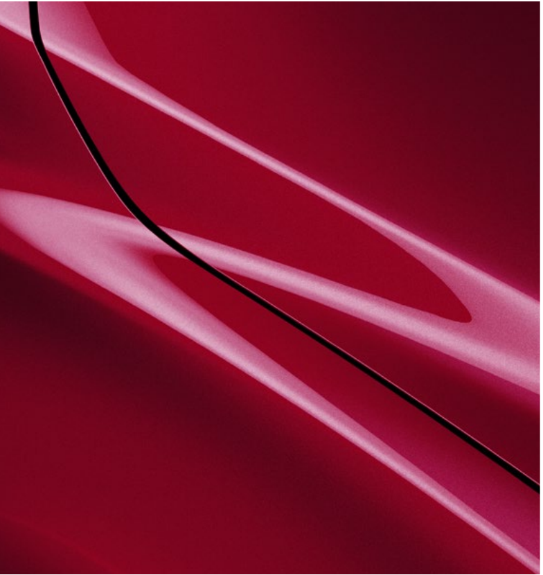
Soul Red Crystal Metallic ^