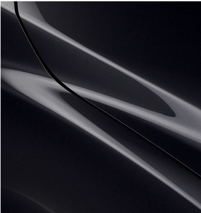
Jet Black Mica