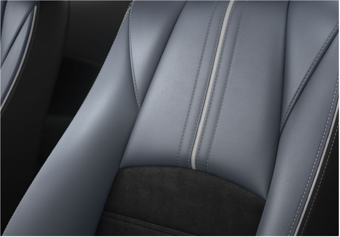
Blue grey leather# with grey Grand Luxe ® ^ synthetic suede (G15 GT)