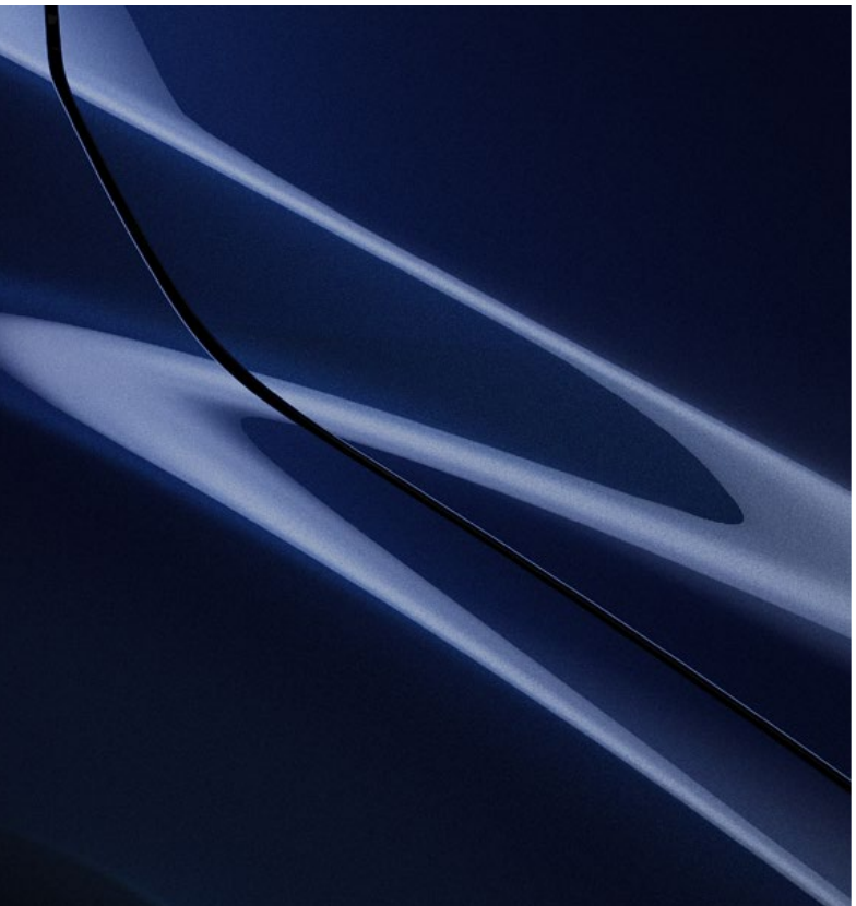
Deep Crystal Blue Mica †