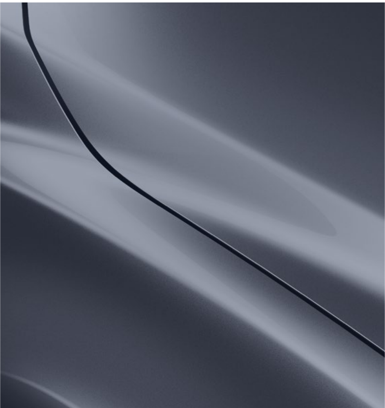
Polymetal Grey Metallic ^†