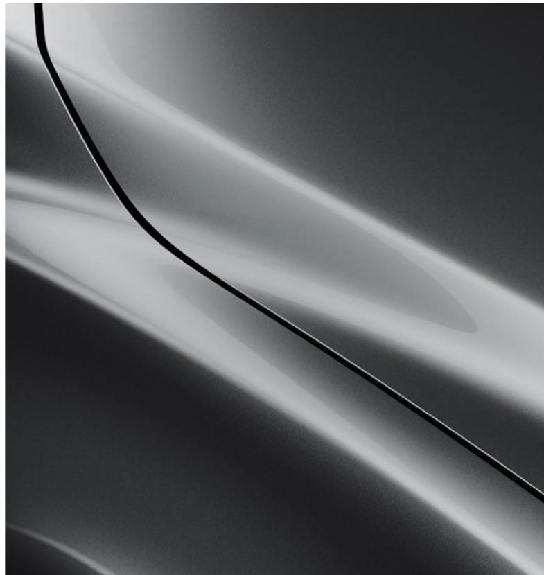
Machine Grey Metallic ^

Fusing the hard appearance of metal with a glossy smoothness, the newly developed Polymetal Grey Metallic comes exclusive to the hatch and changes colour depending on the light, accentuating beautiful lines of bodywork.