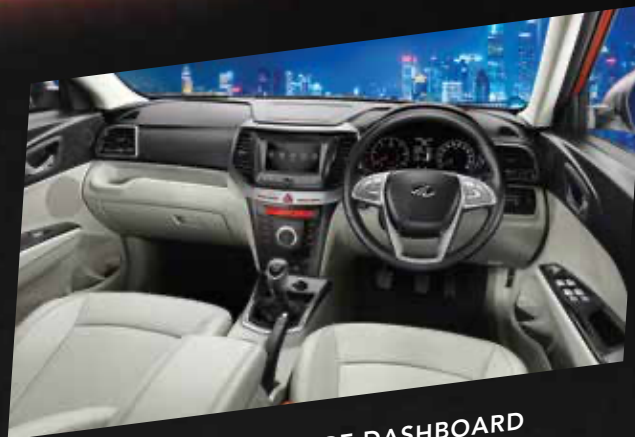
DUAL-TONE BLACK & BEIGE DASHBOARD

LEATHER-WRAPPED STEERING & GEAR KNOB | STEERING MOUNTED PHONE & AUDIO CONTROLS HEIGHT-ADJUSTABLE DRIVER SEAT | ADJUSTABLE BOOT FLOOR | HEIGHT-ADJUSTABLE FRONT SEAT BELTS 60:40 2 ND ROW SPLIT | FLAT FLOOR IN 2 ND ROW | CHROME INSIDE DOOR HANDLES | PIANO BLACK DOOR TRIMS