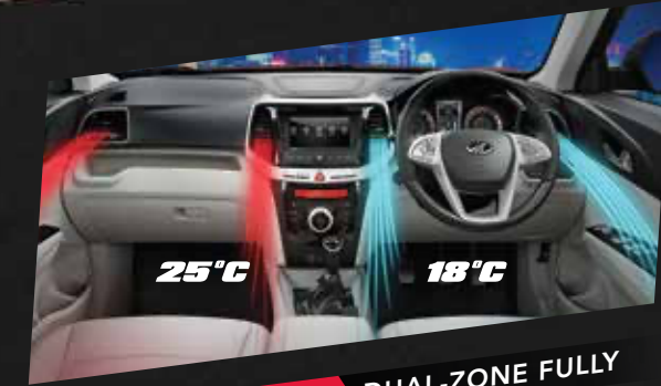
FIRST-IN-SEGMENT DUAL-ZONE FULLY AUTOMATIC TEMPERATURE CONTROL