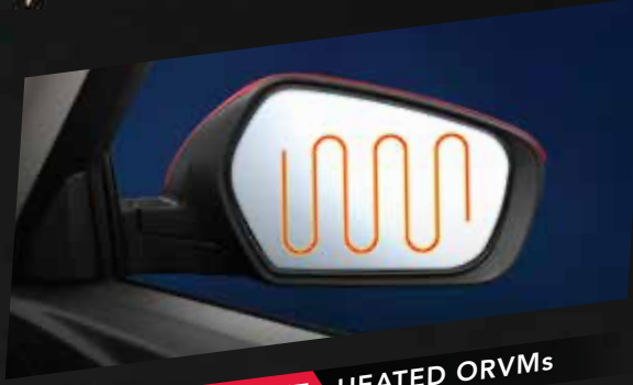
FIRST-IN-SEGMENT HEATED ORVMs