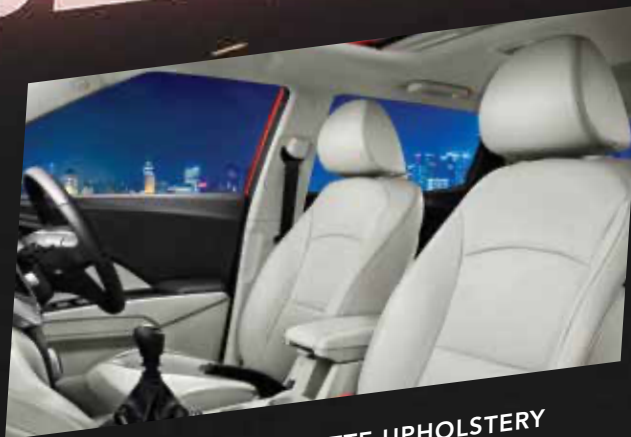
PREMIUM GREY LEATHERETTE UPHOLSTERY