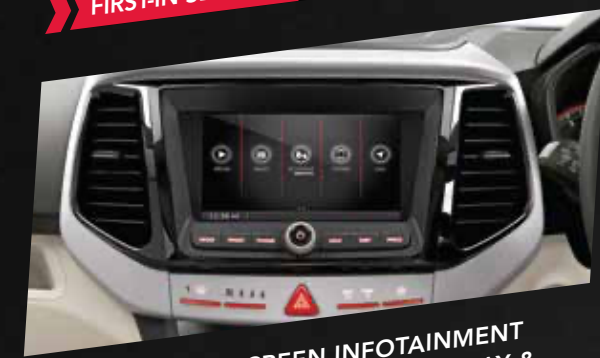
17.78 CM TOUCHSCREEN INFOTAINMENT WITH GPS NAVIGATION, APPLE CARPLAY & ANDROID AUTO™

The XUV300 allows you to adjust the air temperature to create separate, customised environments for the driver and front passenger. With 3 memory slots for your preferred setting, you won't waste time prepping up for your joyride.