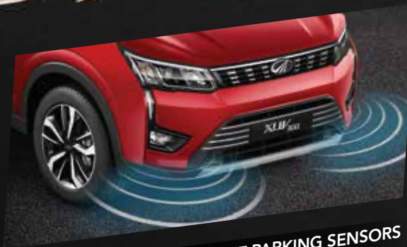
FIRST-IN-SEGMENT FRONT PARKING SENSORS