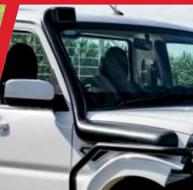
• FIBREGLASS SNORKELS