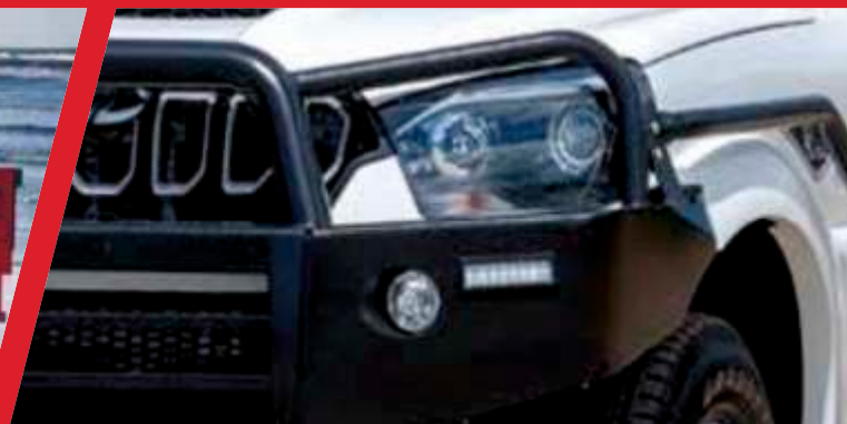
• WINCH COMPATIBLE STEEL BULL BAR AND OPTIONAL BRUSH RAILS