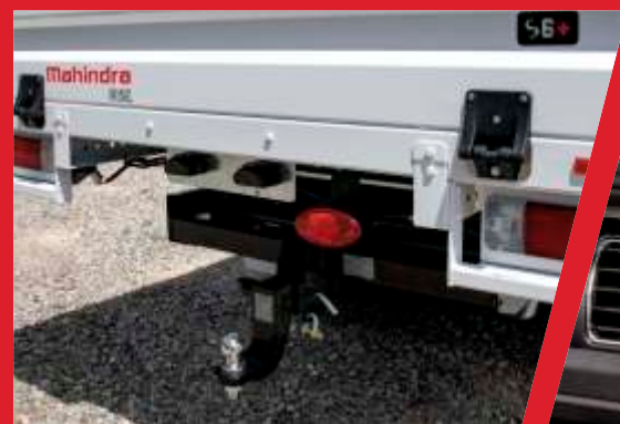
• TOW BAR