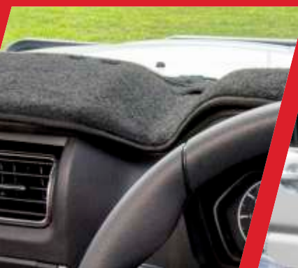
• DASH MAT