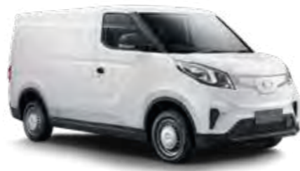
White - Standard Colour

LDV (formerly known as Leyland-DAF Vehicles) is now part of the Chinese state owned SAIC Motor Group. SAIC Motor is the largest automaker in China and one of the largest vehicle manufactures in the world, having partnerships with several Western brands including General Motors, Volkswagen and Iveco. With US$128.8 billion in revenue, SAIC climbed to number 36 on the Global Fortune 500 list of companies in 2018. Aside from producing components like engines, gearboxes, and powertrains, the company also covers the research, production and vehicle sales of both passenger and commercial vehicles. LDV is represented in New Zealand by Great Lake Motor Distributors Ltd, a 100% Kiwi owned company which also distributes the Korean marque SsangYong.