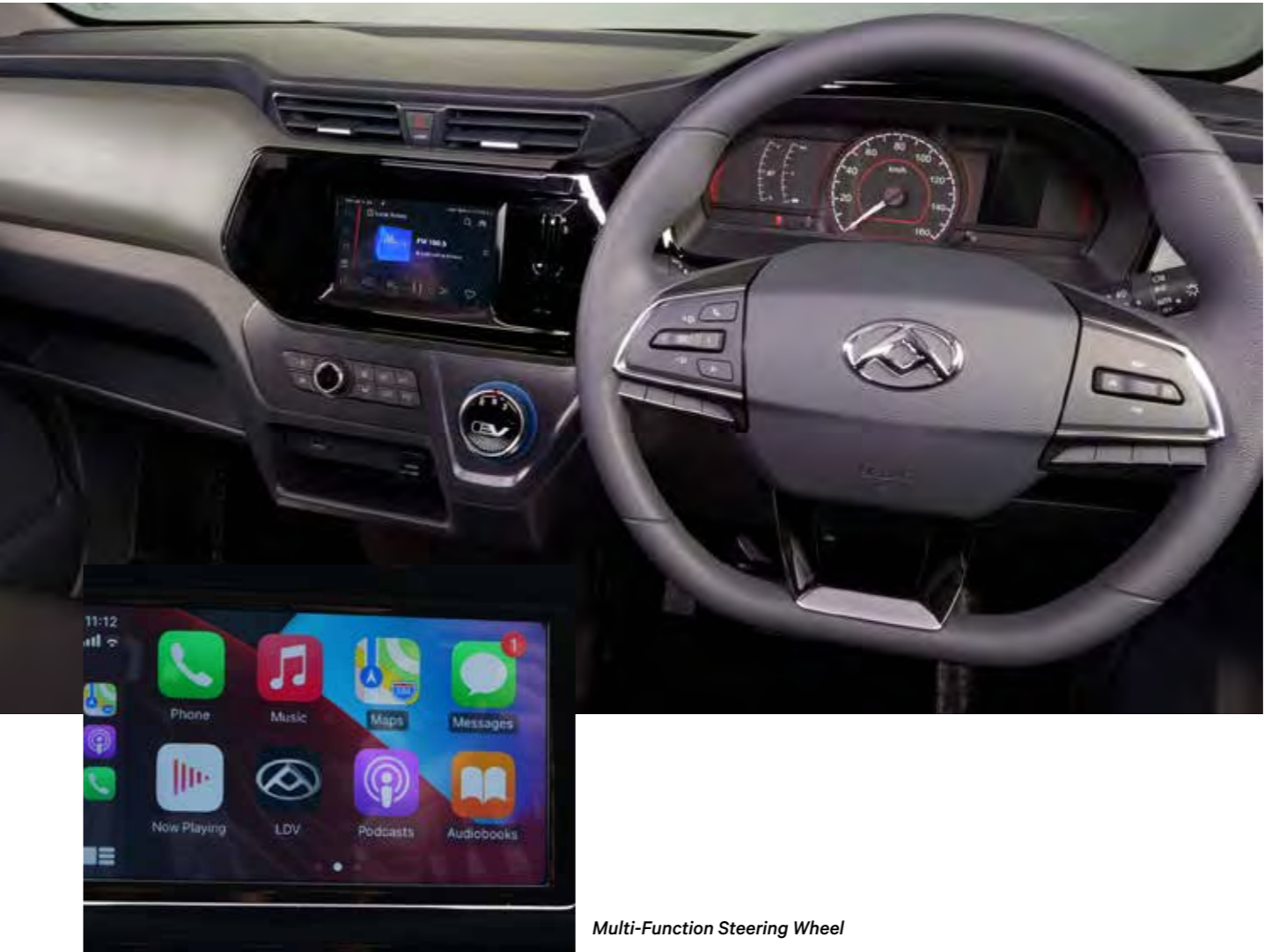
Multi-Function Steering Wheel

Cruise Control allows you to set the cruising speed and keep it constant.