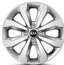
16" Alloy (EX)