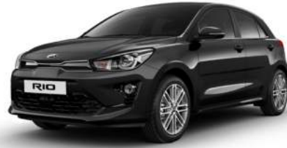
Aurora Black Pearl