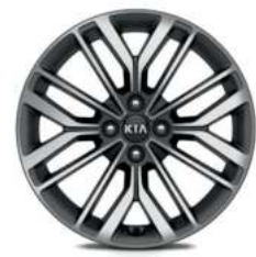
17" Alloy (GT Line and GT Line+)