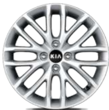
15" Alloy (LX)