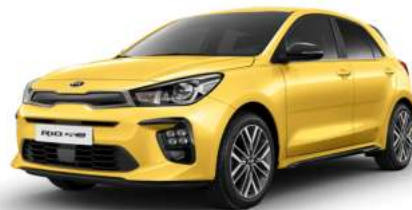
Mighty Yellow (GT Line and GT Line+)