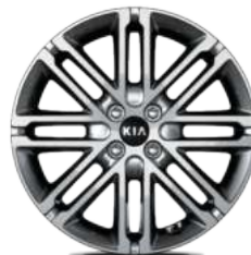
17" Alloy (LTD)