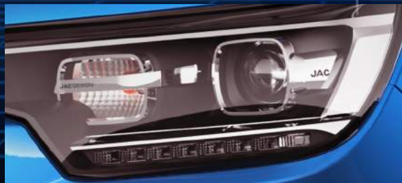
Xenon HID HL and DRL