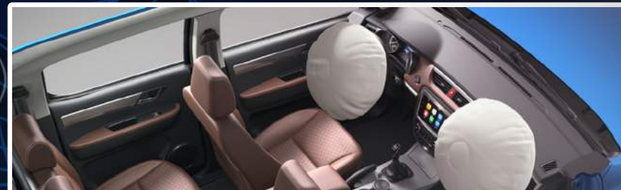
Dual Front Airbags