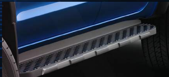
Side Step Boards