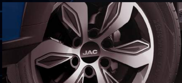
18s Alloy Rims