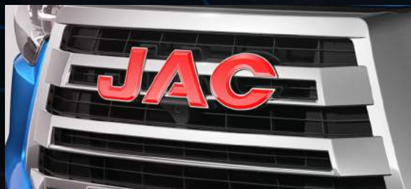
Stylish Signature Grille