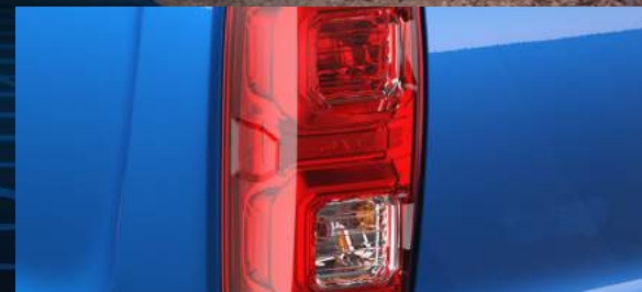
LED C-Type Taillamps