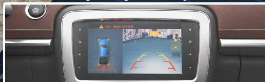
360 Degree Video Camera

ENGINEERED TO GO BEYOND Built Strong for the Journey