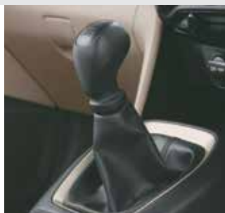
5-speed Manual Transmission