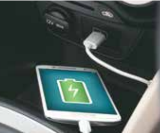
Power Outlet & USB Port

The All New SANTRO is thoughtfully designed for the comfort and convenience of your loved ones. Its ergonomically crafted interiors with Champagne Gold inserts and a host of features enhance the overall driving experience.