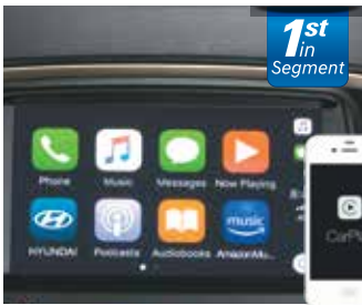
Apple CarPlay Connectivity