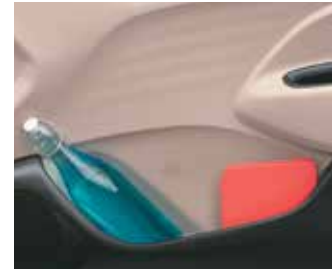
Map Pocket with 1L Bottle Holder