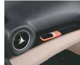
Practical Storage Area