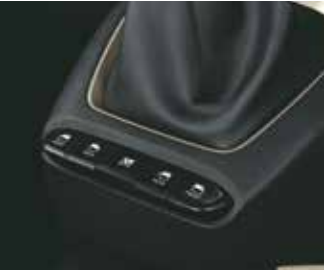
Ergonomically Positioned Power Window Switches