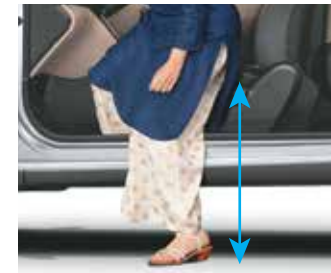
Spacious Cabin with easy Ingress/Egress