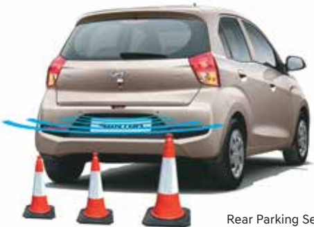
Rear Parking Sensors