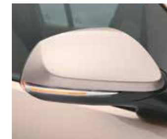
ORVM with Electric Adjustment & Turn Indicators