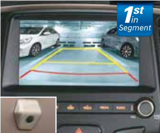
Rear Parking Camera with display on 17.64cm Audio Video Screen