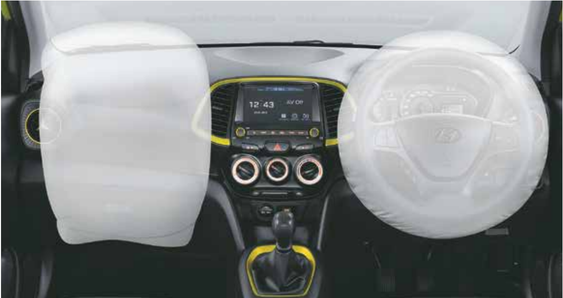
Dual Front Airbags