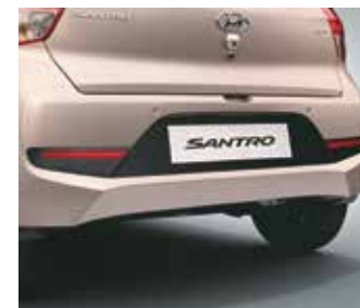
Dual Tone body color Bumpers with Reflectors

Body Colour Door Handles | R14 Steel Wheel with Cover | Z-Shaped Character Lines