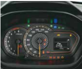
6.35cm Advanced Cluster with Multi Information Display (MID)