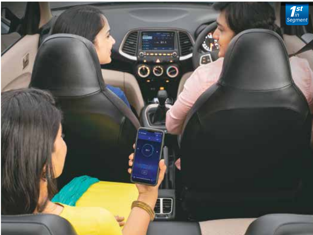
Hyundai iblue Smart Phone App for Audio Remote Control*

Smart technology surrounds you in the All New SANTRO. It features 17.64cm Audio Video System with Smart Phone Connectivity, Voice Recognition & Navigation through Smart Phone and Eco Coating Technology.