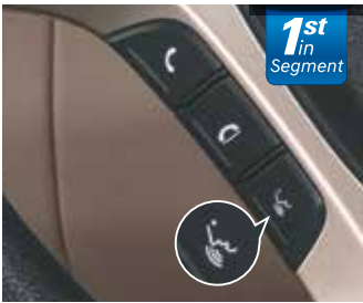
Voice Recognition Button on Steering