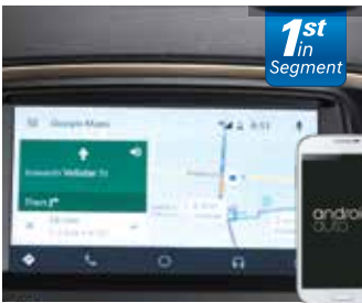
Android Auto Connectivity