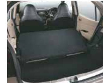
Rear Seat Bench Folding