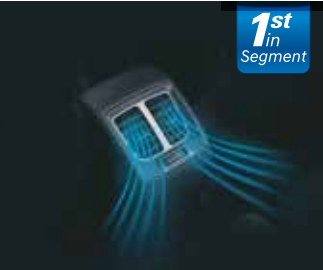
Rear AC Vents