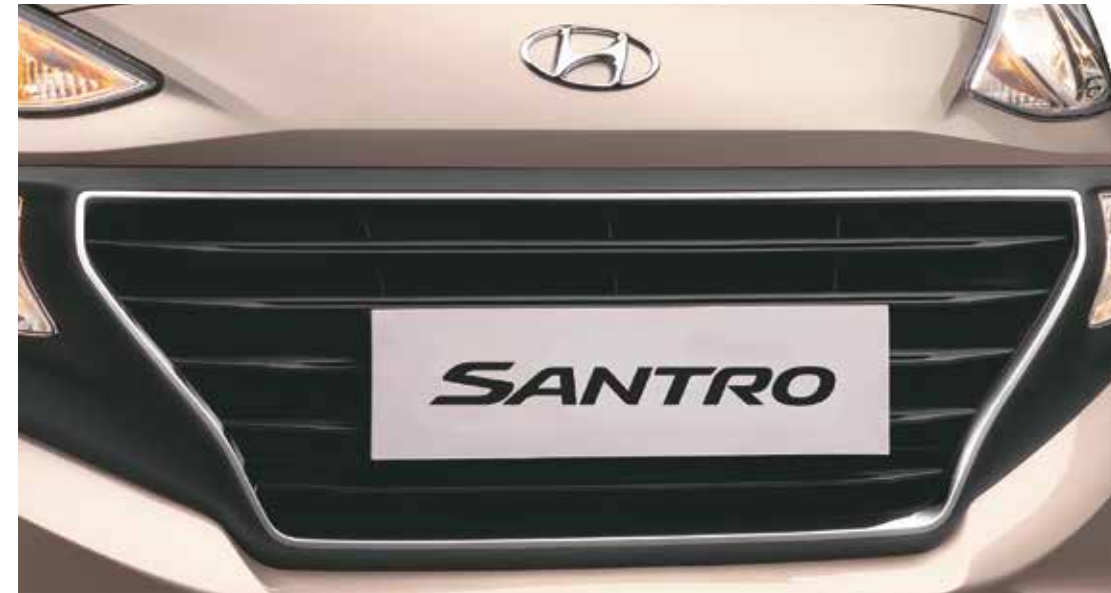
"Cascade design" Chrome Front Grille

Designed for the entire family's pleasure, the All New SANTRO comes with a modern design and a confident stance. While you relish its unmistakable Cascade Grille, high perched Fog Lamps, stylish Headlamps and Tail Lamps, let others admire the modern and unique Z-shaped character lines.