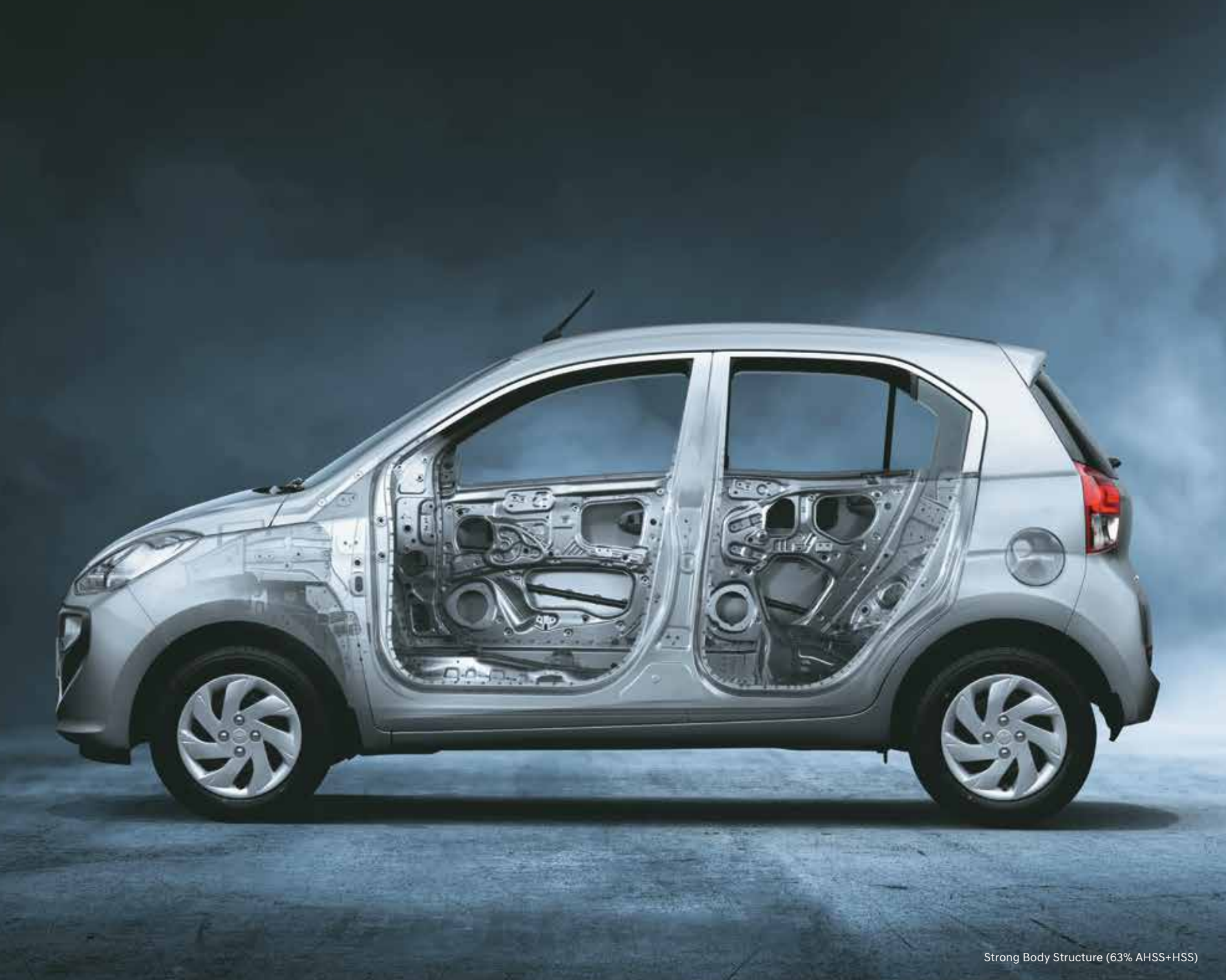
Strong Body Structure (63% AHSS+HSS)