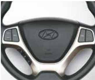
Steering mounted Audio & Bluetooth Controls