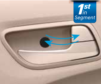
Speed Sensing Auto Door Lock & Impact Sensing Auto Door Unlock