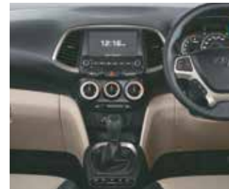
Elephant inspired Unique Centre Fascia

The All New SANTRO offers more room for the entire family and their growing needs. Now you will find long drives more enjoyable and less tiring.