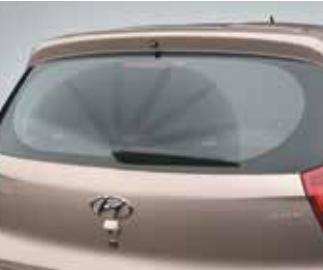
Rear Washer & Wiper