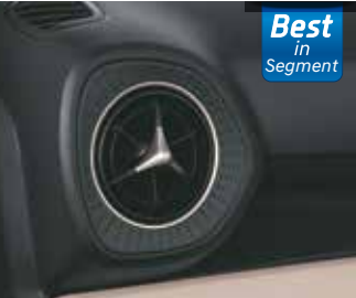
Unique Propeller Design Air Con Vents