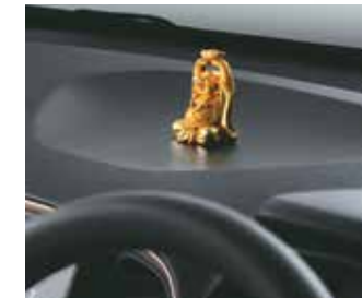
Idol Keeping Space