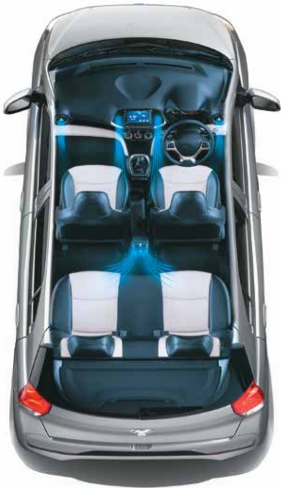
Superior AC Performance