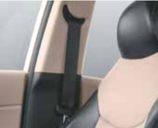
Front Seatbelt Pretensioners with load limiters