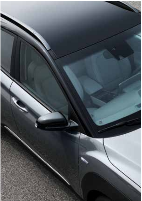
Two-tone roof in Phantom Black Pearl