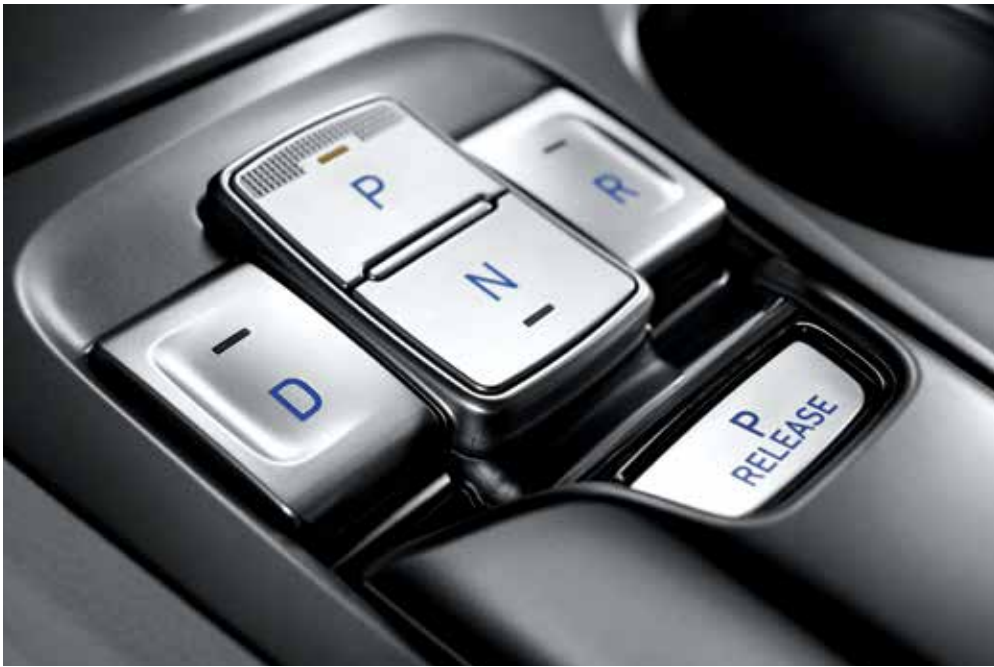
Shift by Wire

The bridge-type center console was applied to further highlight KONA Electric's forward-looking image. The electric push-button transmission adds to the driver's comfort and the high-tech feel.