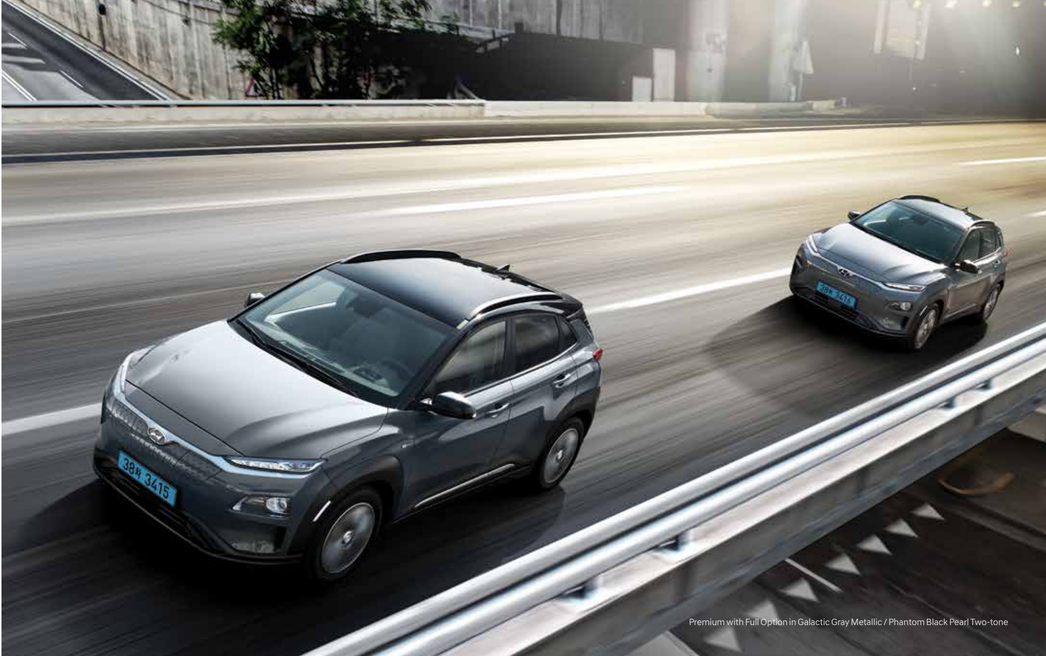
Premium with Full Option in Galactic Gray Metallic / Phantom Black Pearl Two-tone