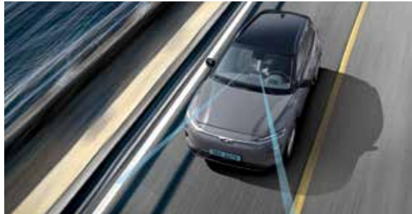
Lane Departure Warning (Offered on All Trim Models) The system displays warning messages on the cluster display and sounds an alarm when the vehicle strays from the intended lane while traveling over a certain speed without the use of an instrument such as a turn signal indicator. Once the system detects that the vehicle is leaving its lane, it provides steering assistance to help the vehicle stay on course.