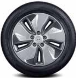
17-inch alloy wheels and tires