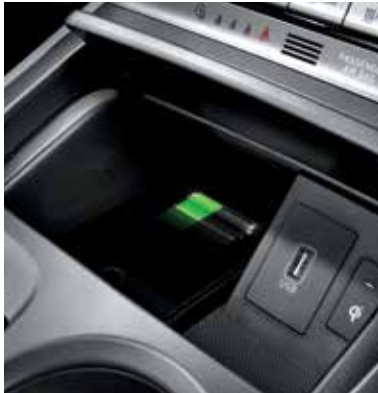
KRELL premium sound system Wireless smartphone charger