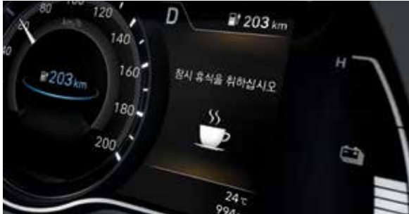
Driver Attention Warning (Offered on All Trim Models) This system monitors and displays driver's attention level and displays warning messages on the cluster display and sounds an alarm if the driver's level of alertness drops to "inattentive".