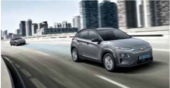
Smart Cruise Control (with Stop & Go / Options Available as Part of Hyundai's SmartSense Package) This system keeps a safe distance from the vehicle in front and helps maintain the speed preset by the driver. Furthermore, if the vehicle in front stops, the system stops the vehicle and also resumes moving if the vehicle in front starts to move forward soon afterwards.