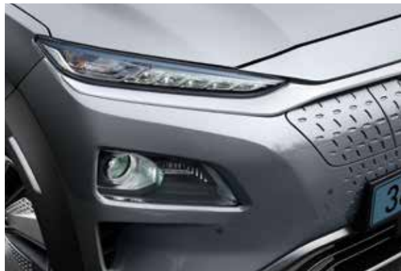
17-inch alloy wheels LED daytime running lights (with positioning lights)