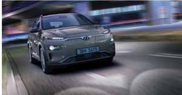
High Beam Assist (Offered on All Premium Trim Models) This system detects vehicles in front, oncoming vehicles, and the brightness of the surroundings and automatically switches the high beams on or off.