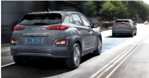
Forward Collision Avoidance Assist (Offered on All Trim Models) This system detects vehicles, pedestrians, and bicyclers in front and alerts the driver of a potential collision. Additionally, the system activates the brakes if a collision is likely to occur.

Hyundai SmartSense is a package of intelligent technologies that ensure the safety and comfort of the driver.