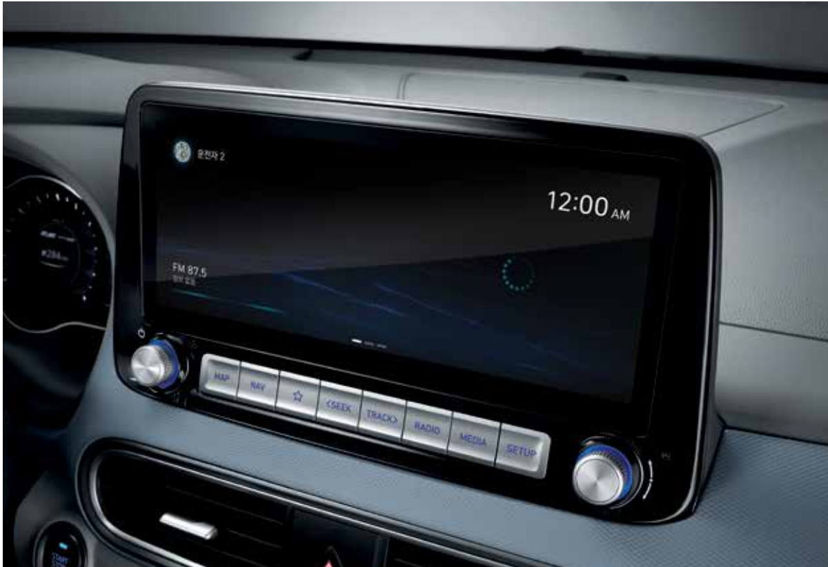
10.25" GPS Navigation (navigation updates provided free of charge)