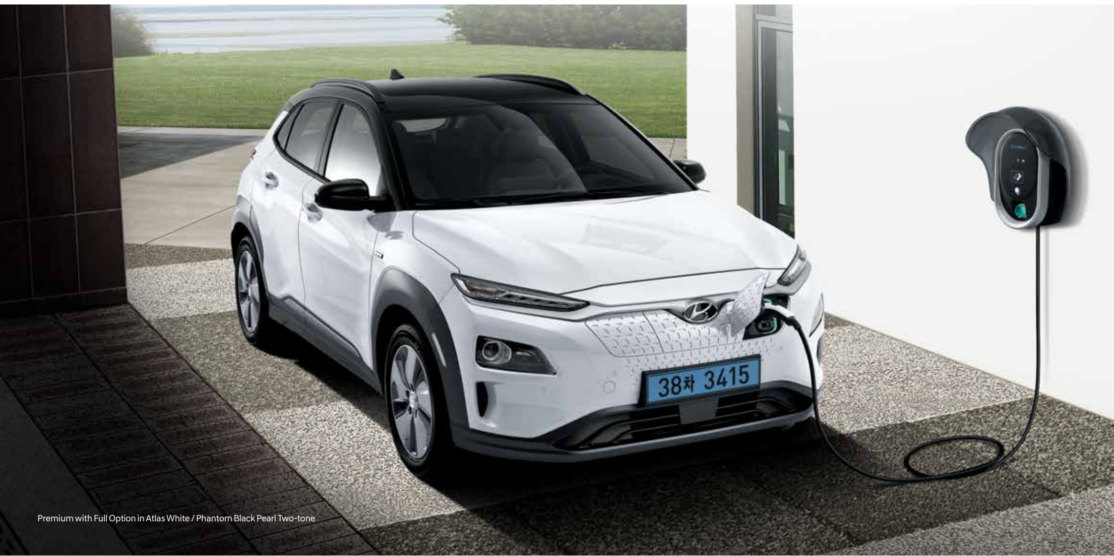
Premium with Full Option in Atlas White / Phantom Black Pearl Two-tone

The high-performance motor and high-capacity battery mounted on KONA Electric make your driving experience even more pleasant and dynamic. Experience the joy of driving that this smart EV has to offer.