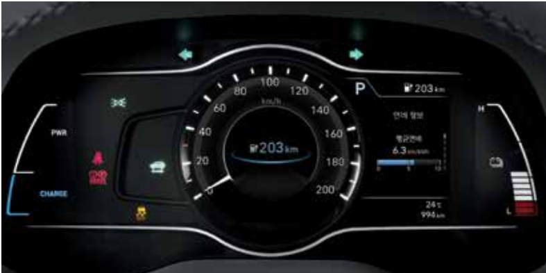
Head-up display (combiner) Virtual cluster (7-inch color LCD)

KONA Electric boasts the practicality of an SUV, while providing information via the head-up display, virtual cluster, and 10.25-inch navigation in an intuitive manner.