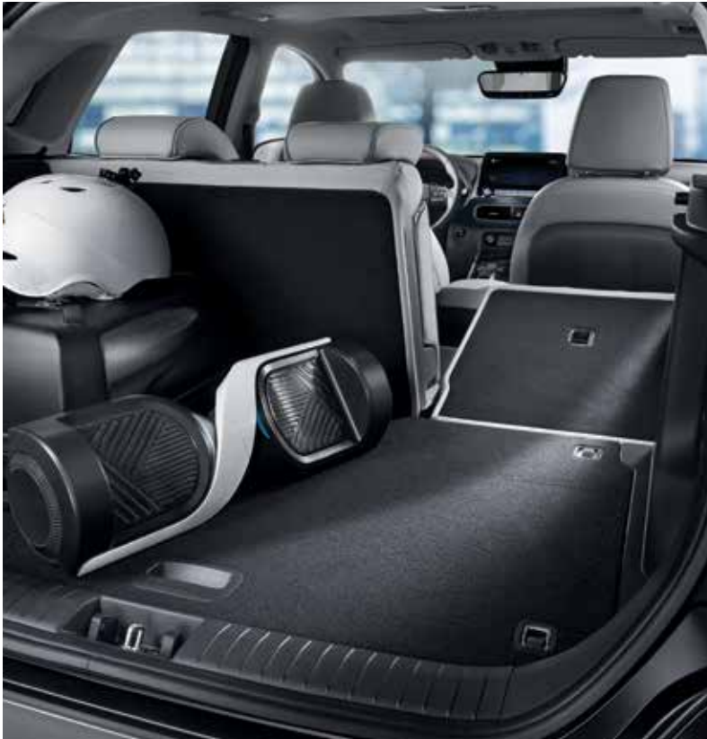
60/40 split folding seats