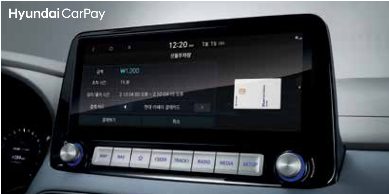
Air purification mode Hyundai CarPay