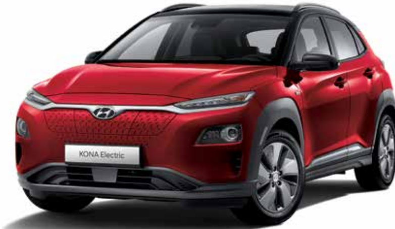
Premium with Full Option in Pulse Red Pearl / Phantom Black Pearl Two-tone