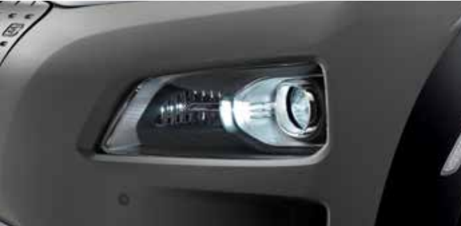
LED headlamps (static bending lights) Electronic parking brake (with auto hold)