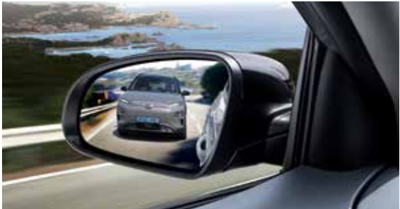
Rear Cross-Traffic Collision Warning (Option Available as Part of Hyundai's SmartSense Package) This system displays warning indicators on the side view mirrors and sounds an alarm when it detects vehicles approaching from the rear and sides and senses a possible collision when the driver switches on a turn signal indicator to change lanes..