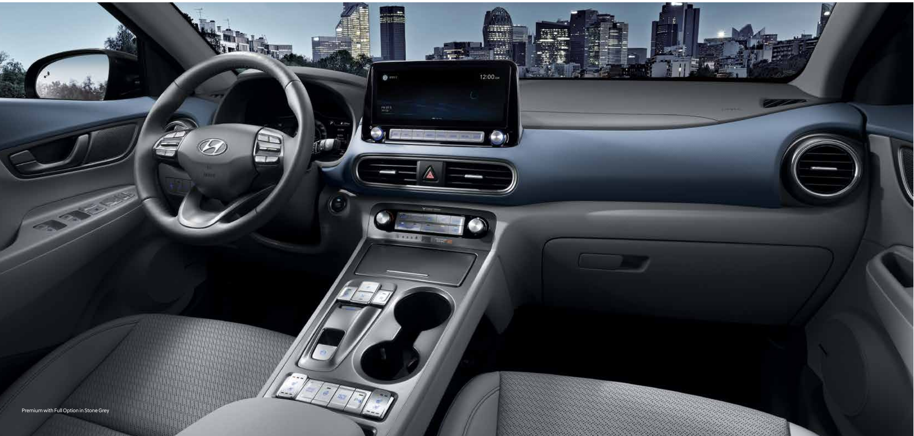
Premium with Full Option in Stone Grey