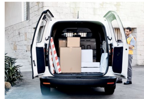
Top: Automatic dusk sensing headlamps Bottom: Twin swing rear doors (optional)