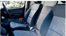
3 seater van