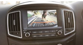
Rear view camera 1