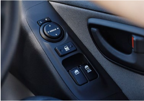
Power windows and mirrors