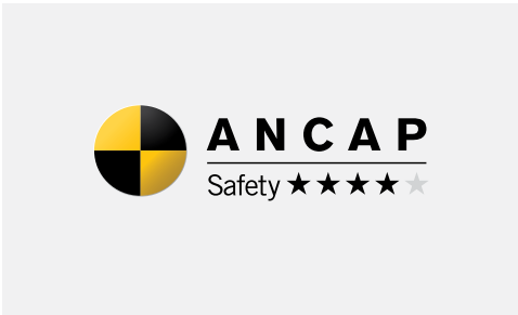
4 star ANCAP safety rating