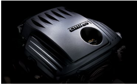
2.5 CRDi diesel engine

The iLoad will continue to perform time and time again, and will soon become one of the most trusted and hardworking members of your crew. If you're looking for a commercial van with real get up and go, look no further than the iLoad.