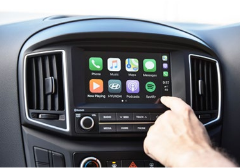
7" touchscreen display with Apple CarPlay™ 1 and Android™ Auto 2 compatibility

No matter what business you're in, it's easy to stay connected, anywhere, anytime. You could say the iLoad is a complete mobile office solution.