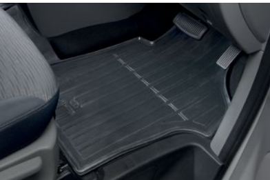
Top: Cargo barrier Middle: Full technician kit 11 Bottom: Tailored rubber floor mat