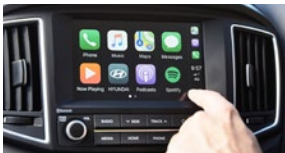
7" touchscreen with Apple CarPlay™ 2 and Android™ Auto 3