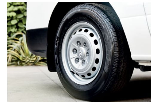
Top: Dual sliding doors Bottom: 16" steel wheels