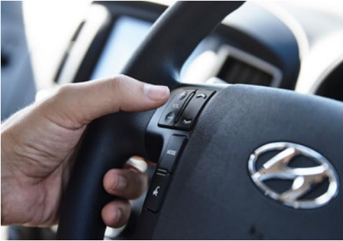
Steering wheel mounted audio controls