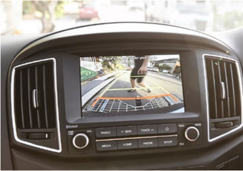
Rear view camera 3