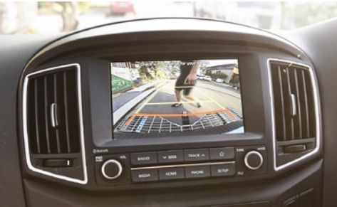
Rear view camera 1

No matter where you take your iLoad, you can be confident that we've done everything we can to ensure an all-round safer ride.