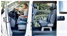
Dual sliding doors