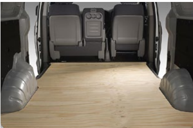
Top: 16 inch alloy wheel (sold singular) Middle: Commercial roof racks 10 Bottom: Couriers' wooden floor