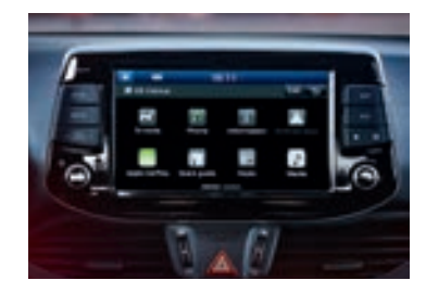
8" Touchscreen Navigation