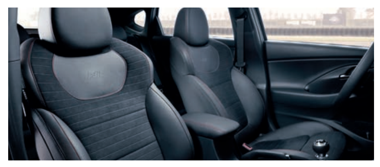
Faux Suede and Leather (Seat Facings only) on N Exclusive Sport Seats.

Interior shown i30 Fastback N. Not to UK specification.