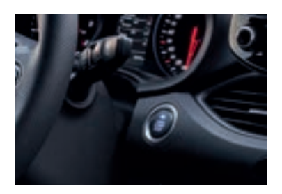
Engine Start/Stop Button