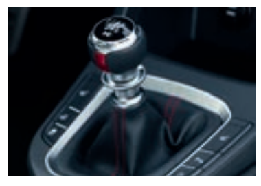
Leather Wrapped N Gear Knob

With comfortable surroundings and a well-appointed interior, the i30 Fastback N brings an air of luxury. Everything is at your fingertips, so you can focus on the drive.