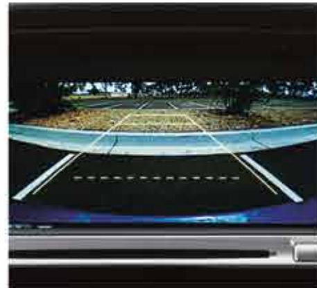
REVERSE CAMERA Parking ease and convenience with better rear vision.