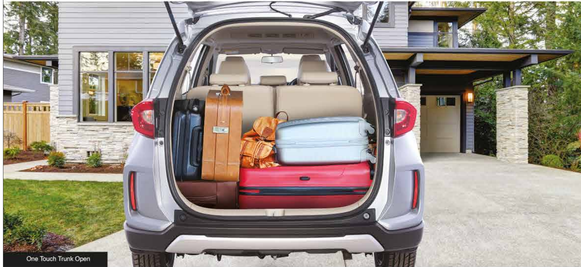
One Touch Trunk Open