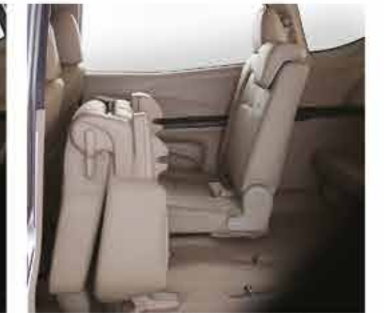
ONE TOUCH TUMBLE 2ND ROW SEAT

10 CUP HOLDERS Storage options abound with 10 handy cup holders found throughout the BR-V.