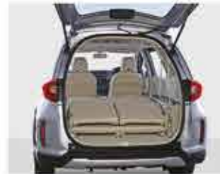
Fully Foldable 2nd Row

50:50 TILT & FULL TUMBLE 3RD ROW The 3rd row seats can be adjusted so that the back seats lies flat or fully tumbled to maximize boot space.