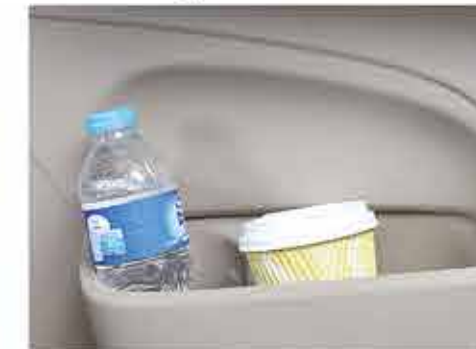
REAR DOOR POCKET