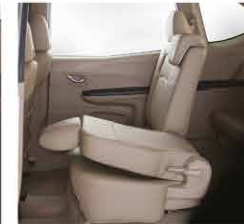
50:50 FOLDING 2ND ROW