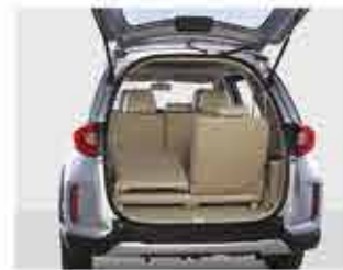
50:50 Folding 3rd Row