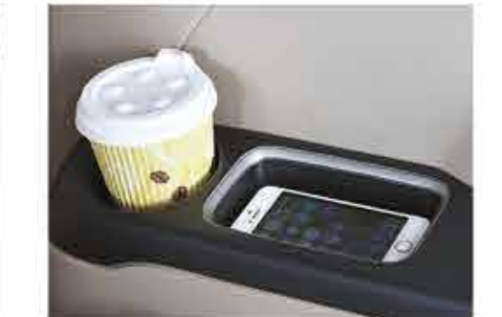
3rd ROW MOBILE AND GLASS HOLDER