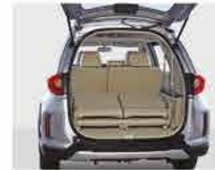
Fully Foldable 3rd Row