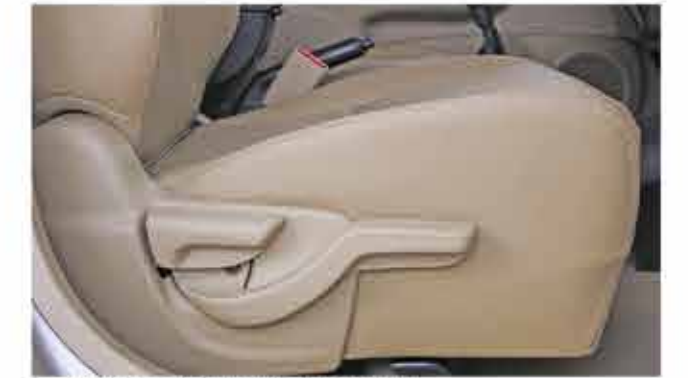
DRIVER SEAT HEIGHT ADJUSTER Feel at home on every journey by adjusting your seat the way you like.