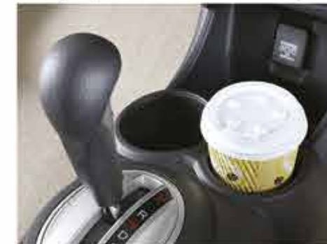
FRONT CUP HOLDER

10 CUP HOLDERS Storage options abound with 10 handy cup holders found throughout the BR-V.