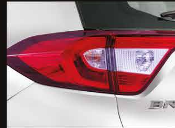
LED TAIL LIGHTS The stylized LED tail lights.

BR-V driving experience becomes more confident with the modern design, because of its refined and stylish exterior appearance.