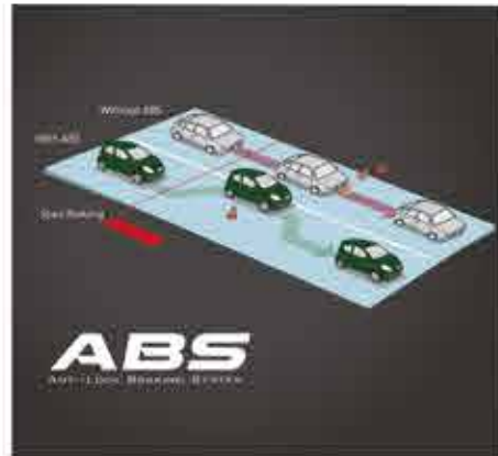
ANTI-LOCK BRAKING SYSTEM (ABS) ABS improves vehicle control by preventing wheels from locking in case of sudden braking.