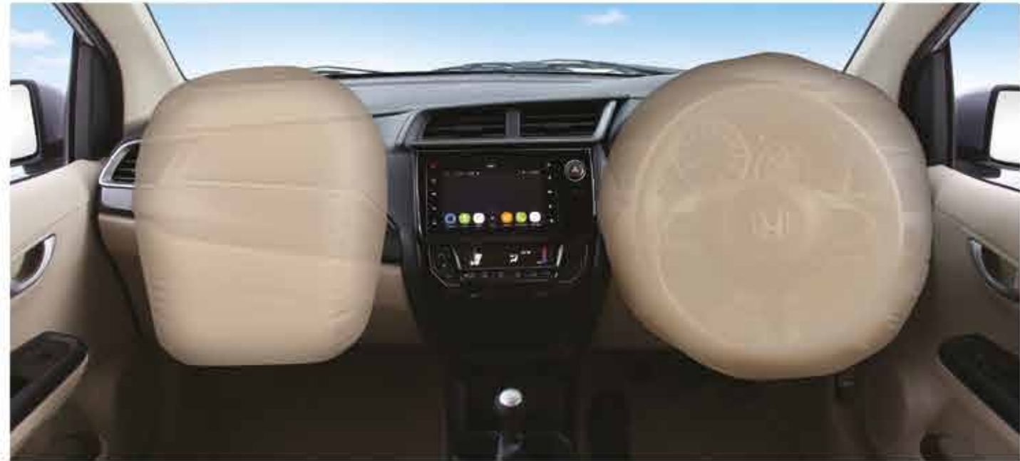
DUAL SRS AIR BAGS (DRIVER & ASSISTANT) Protects driver and passenger from heavy impacts resulting in head-on collisions.

SAFE & SECURE BR-V comes equipped with safety standards which deliver peace of mind to the passengers.