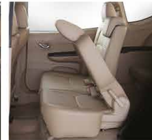
ONE TOUCH TILT 2ND ROW