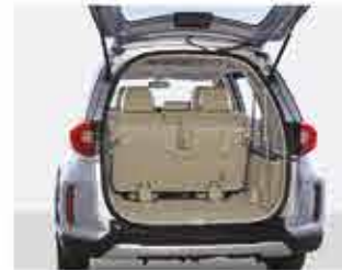
One Touch Tumble 3rd Row Seat