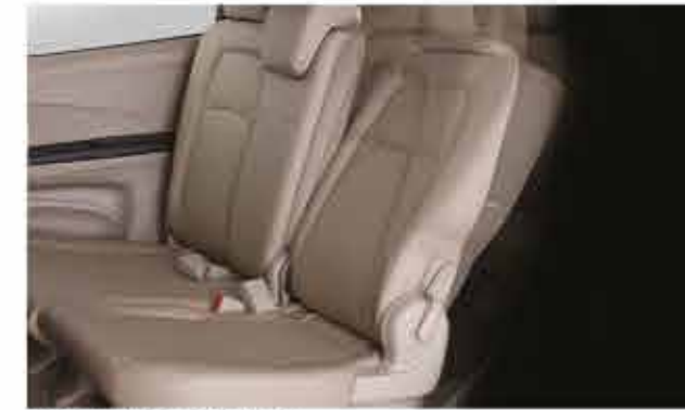
RECLINING 2ND ROW Smoothly slides backwards to adjust the 2nd row passenger's comfort level.

50:50 TILT & FULL TUMBLE 3RD ROW The 3rd row seats can be adjusted so that the back seats lies flat or fully tumbled to maximize boot space.