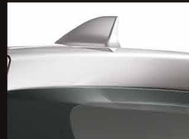
SHARK FIN ANTENNA Get the impeccable car look with a stylish shark fin antenna and Improved Radio Reception.