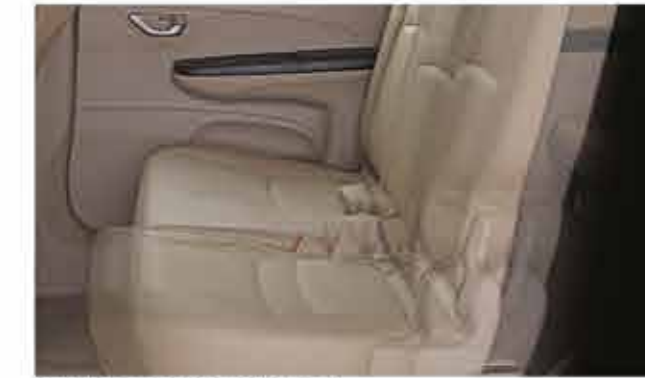
SLIDING SEATS 2ND ROW The 2nd row smoothly slides backwards and forwards to adjust to your passengers comfort level.