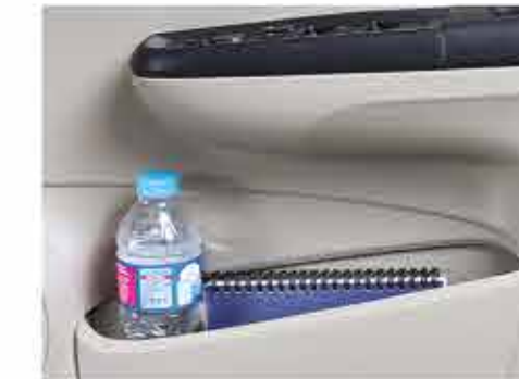
FRONT DOOR POCKET