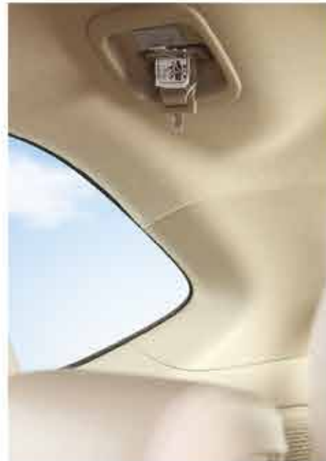
3RD ROW SEAT BELT