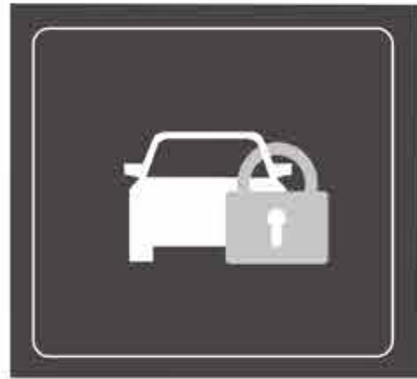
IMMOBILIZER ANTI-THEFT SYSTEM Enhances safety with peace of mind.