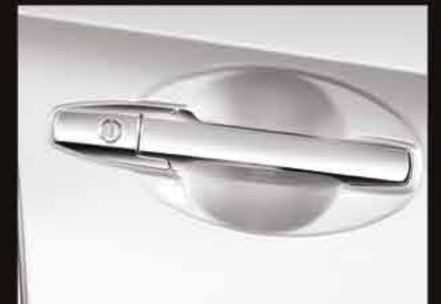
CHROME DOOR HANDLES The high gloss shiny chrome finished handles adding stance to the exterior.