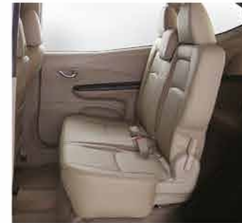
FULLY FOLDABLE 2ND ROW