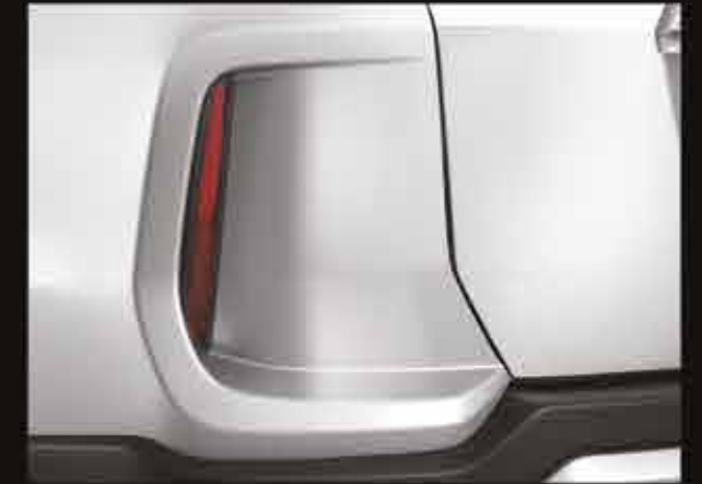
REAR REFLECTOR Eye catching vertical rear reflectors enhances your car's visibility.