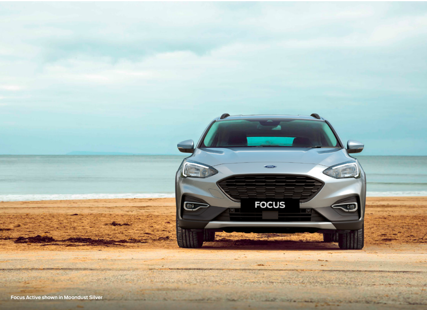
Focus Active shown in Moondust Silver