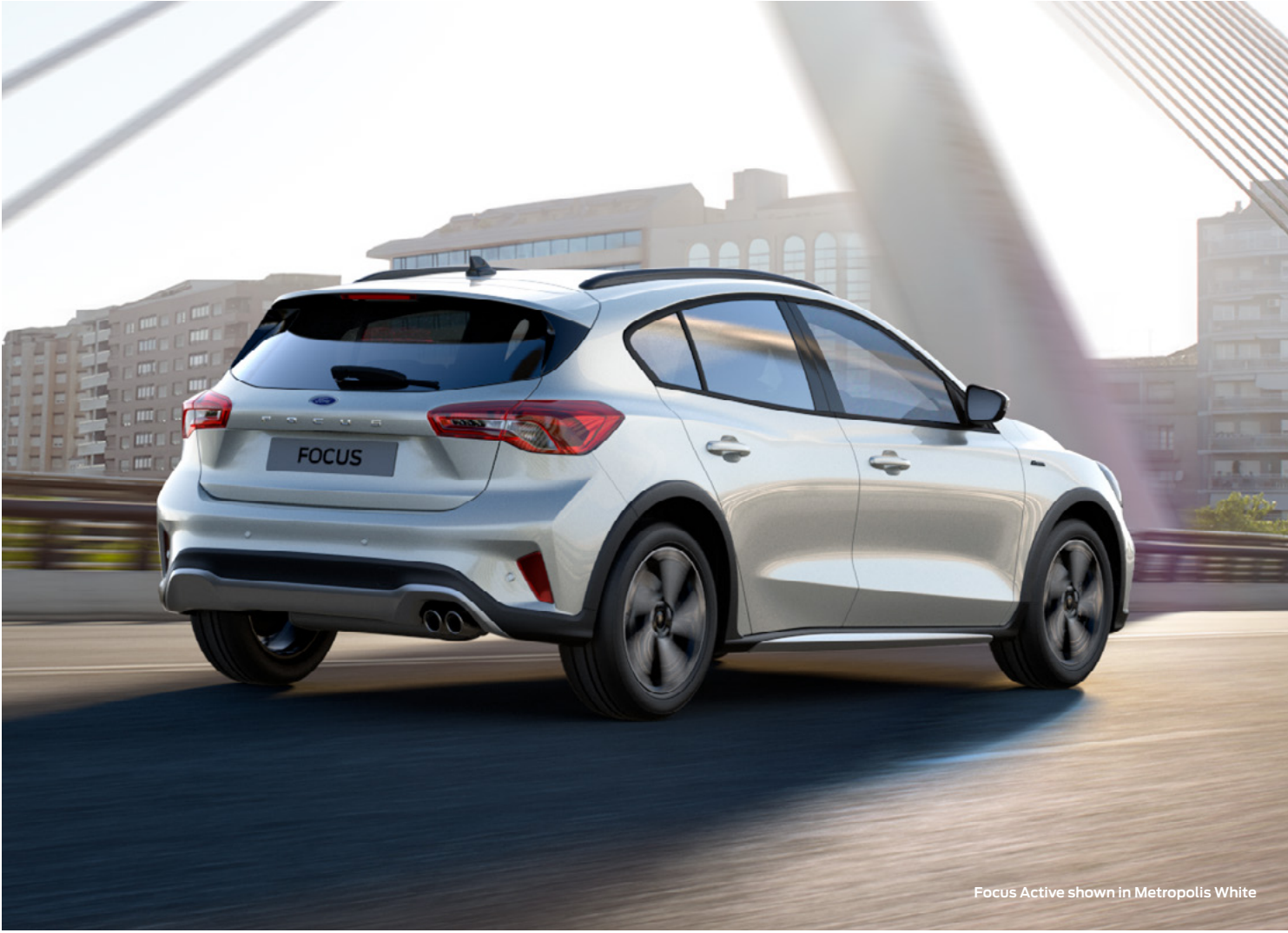
Focus Active shown in Metropolis White