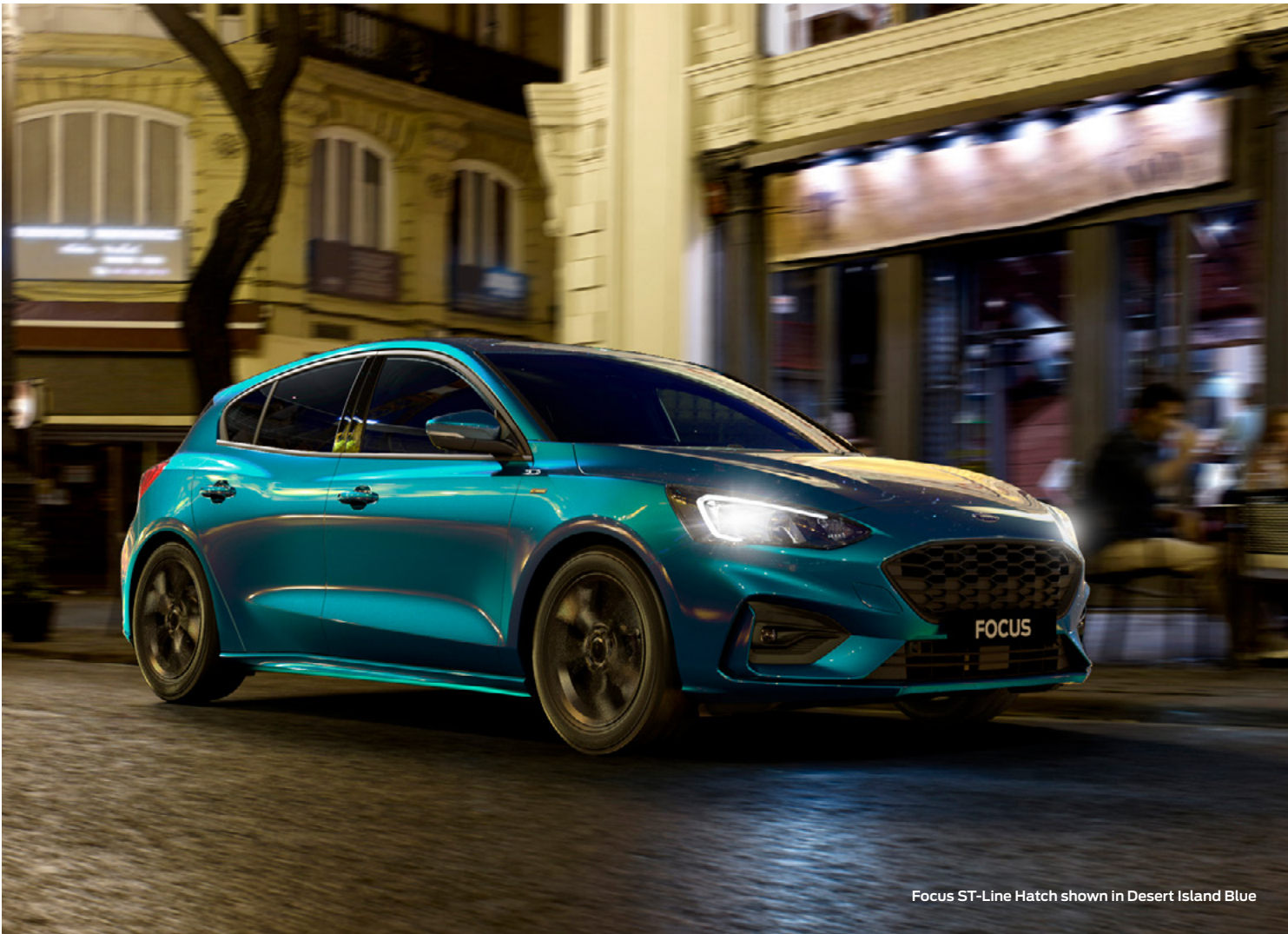
Focus ST-Line Hatch shown in Desert Island Blue