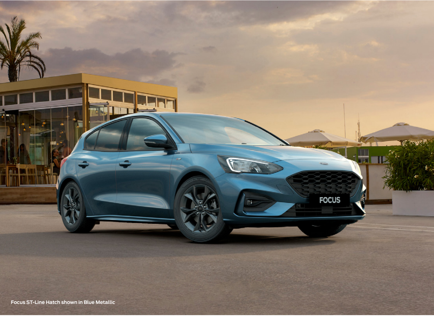
Focus ST-Line Hatch shown in Blue Metallic