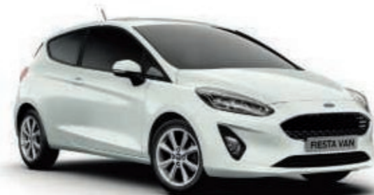
Frozen White Solid body colour*

1. Sport Insert: Court in Ebony Bolster: View in Ebony