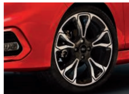
18" Rock Metallic machined alloy wheels. (Option)

1.0L Ford EcoBoost Hybrid 125 PS (92 kW)