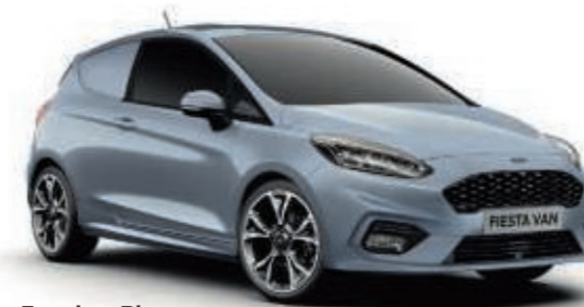
Freedom Blue Metallic body colour*†