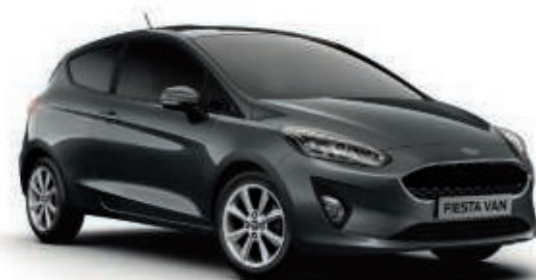
Magnetic Metallic body colour*