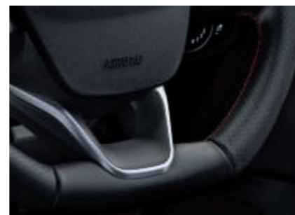
Steering wheel with perforations and red stitching. (Standard)