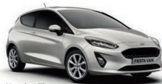
Moon dust Silver Metallic body colour*