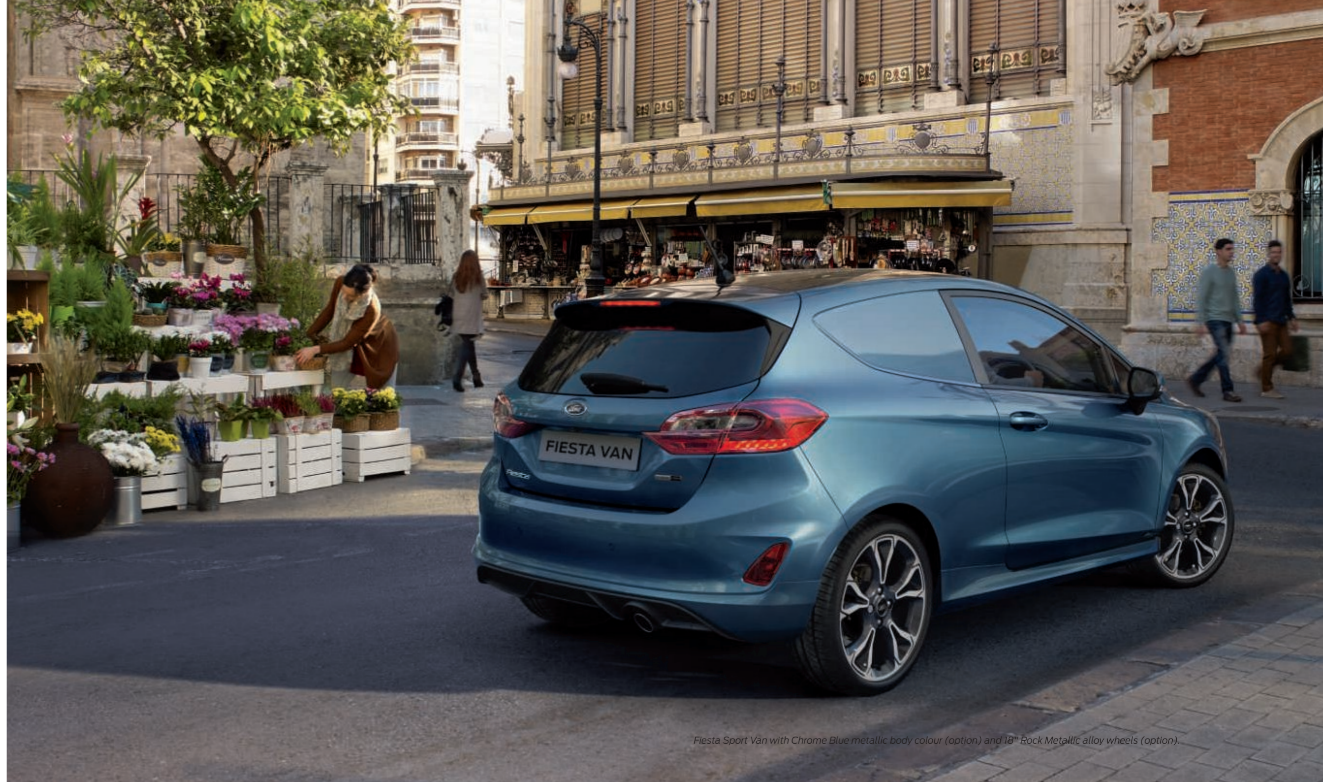
Fiesta Sport Van with Chrome Blue metallic body colour (option) and 18" Rock Metallic alloy wheels (option).