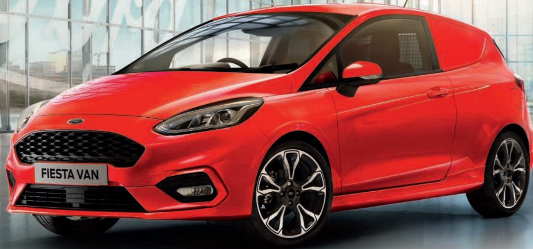
Fiesta Sport Van with Race Red body colour (option) and 18" Rock Metallic / machined alloy wheels (option).