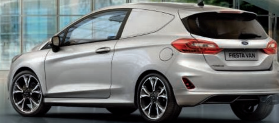
Fiesta Sport Van with Moondust Silver metallic body colour (option) and 18" Rock Metallic machined alloy wheels (option).