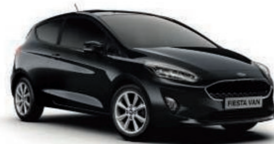
Agate Black Metallic body colour*