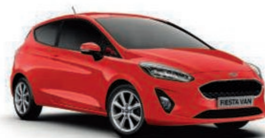
Race Red Solid body colour