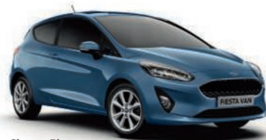
Chrome Blue Metallic body colour*