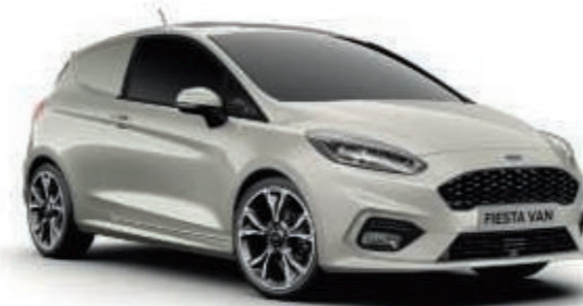
Metropolis White Metallic body colour*†