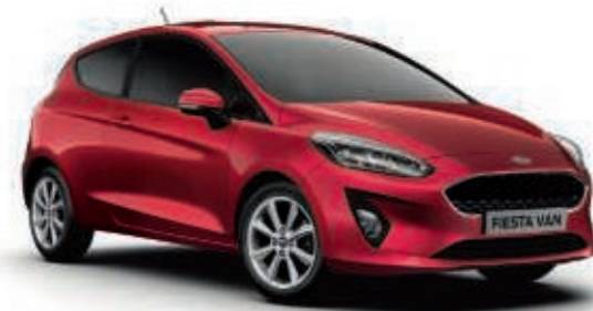
Ruby Red Metallic body colour*