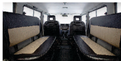
Most Comfortable and Spacious Seating Layout (5+D)