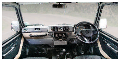
Best-in-Class All Around Visibility