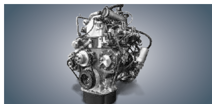
Flat Peak Torque of 230 Nm Over a Wide 1000 rpm Range