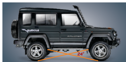
Best-in-Class 24° Ramp Over Angle