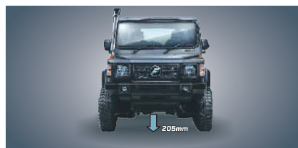
Unmatched High Ground Clearance 205mm