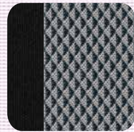
157 Doria Grey Cloth