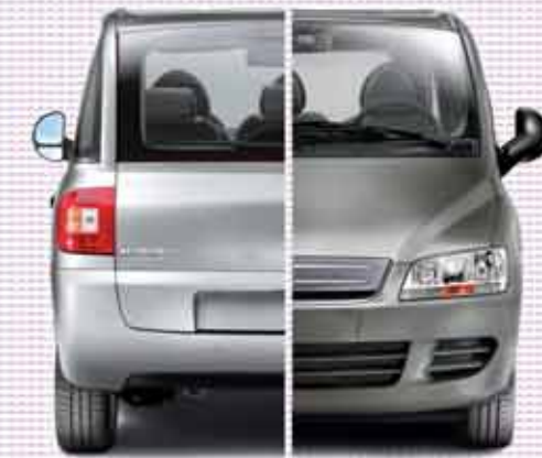
612 Minimal Grey 690 Digital Grey