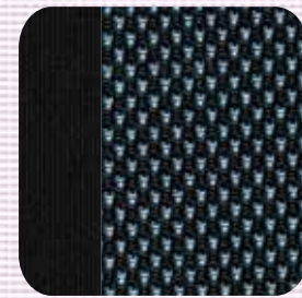
188 Inox Blue/Black Cloth