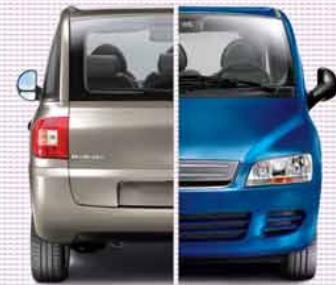
261 Indie Ivory 599 New Orleans Blue