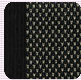
187 Inox Beige/Black Cloth