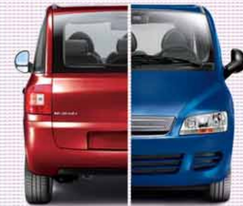
148 Steel Drum Red 475 Rock'n'Roll Blue