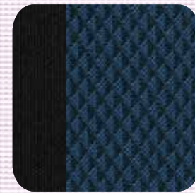
144 Doria Blue Cloth