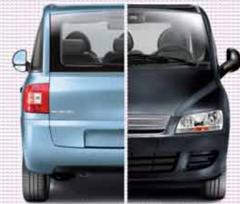
457 Psychadelic Azure 891 Crossover Black