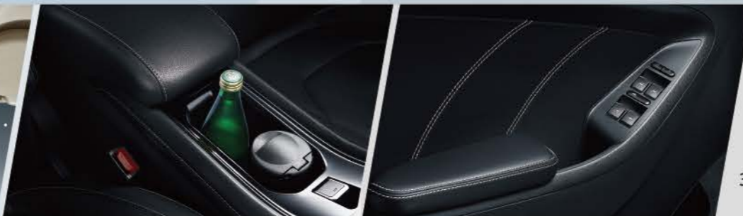
30+ Storage Spots