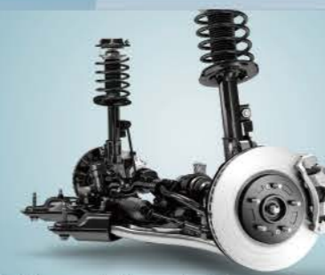
Front MacPherson Independent Suspension + Four-wheel Disc Brake