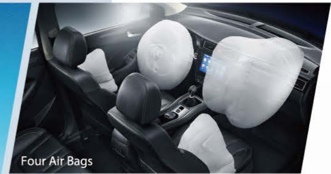
Four Air Bags