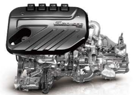
1.5T Turbocharged Engine + 6MT/CVT Transmission

The perfect combination of vigorous powertrain and sedan-level NVH, advanced in technology as well as user-friendly, which gives Glory 580 the controllability performance superior than the competitors, making sure your need for speed is satisfied while maintaining the best quietness.