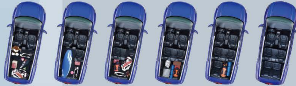
2 Seats to 7 Seats: Multi-functional and Flexible Space