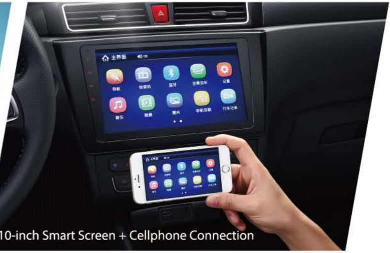
10-inch Smart Screen + Cellphone Connection