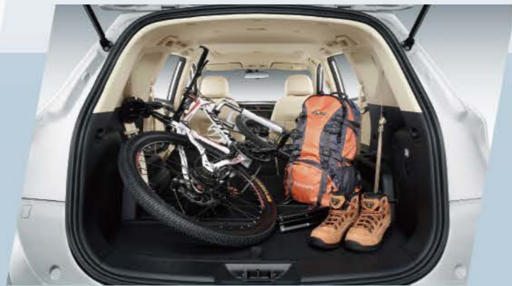
Luggage Length 390-1960mm, Creating Sufficient Space