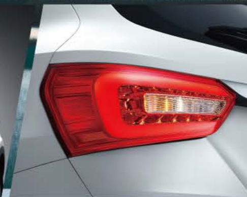
Dual C-shaped Tail Lamp