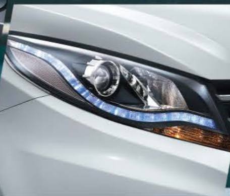
Lion-eye Shaped Headlamp