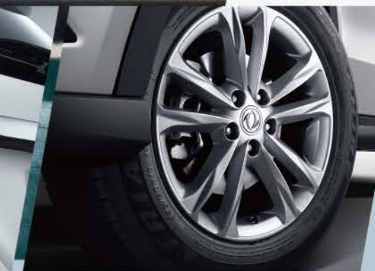
17-inch 225 Tyre + Radial Blade Wheel Rim