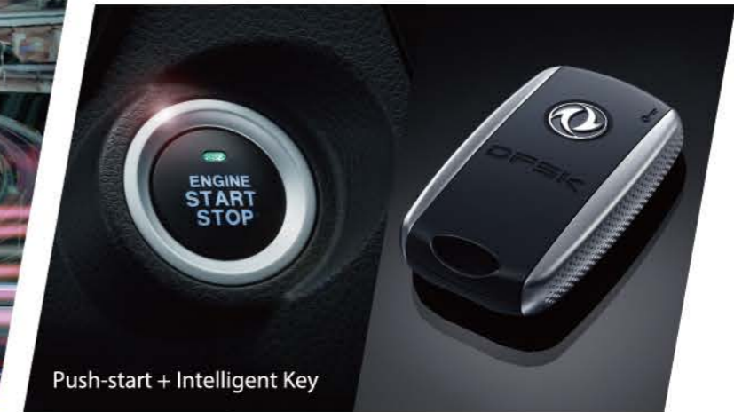
Push-start + Intelligent Key