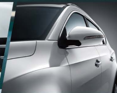
Bowstring Shaped Waistline