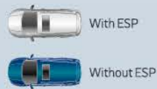
Electronic Stability Program