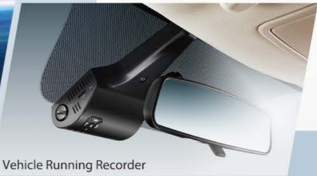
Vehicle Running Recorder