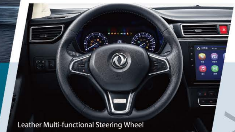
Leather Multi-functional Steering Wheel