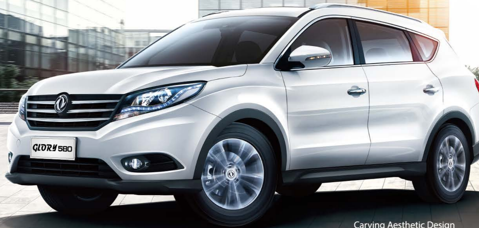
Carving Aesthetic Design