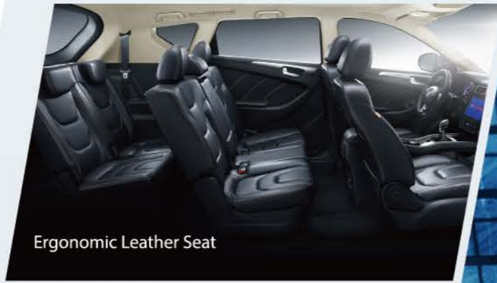
Ergonomic Leather Seat