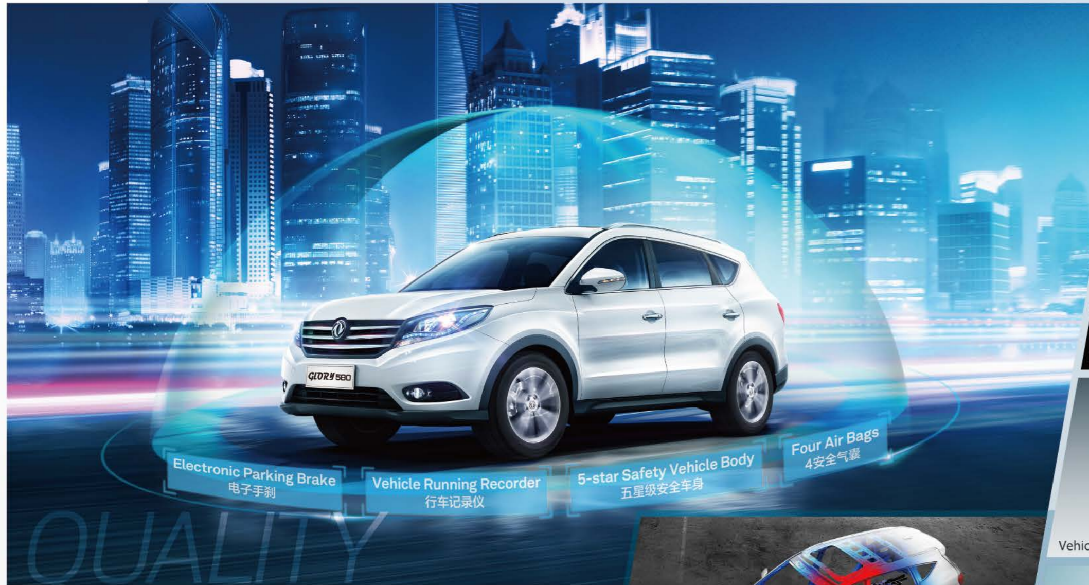
Electronic Parking Brake 电子手刹

The considerate intelligence and safety equipment offers the high-quality driving and seating experience for you and your family. Everything only for you.