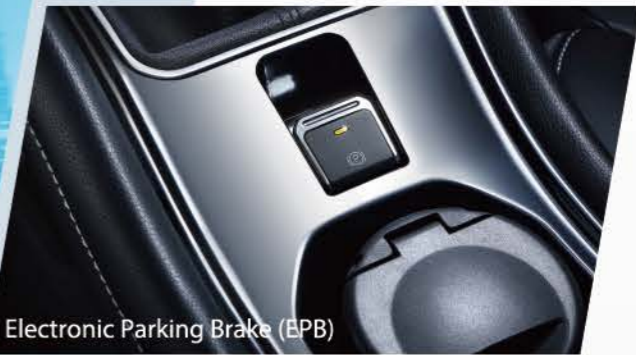
Electronic Parking Brake (EPB)