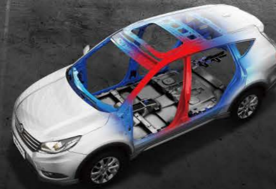
5-star Safety Vehicle Body