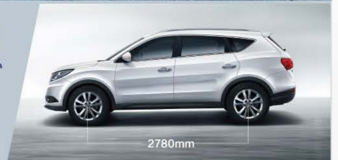
2780mm Extra Long Wheelbase