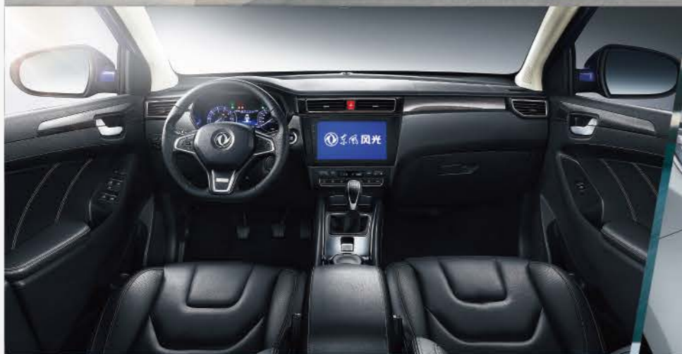
Delicate Interior + Intelligent Central Console