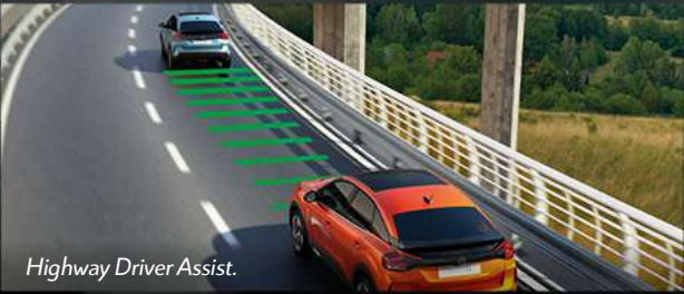
Highway Driver Assist.

The Highway Driver Assist semi-autonomous driving system combines the adaptive cruise control with Stop & Go function with a system that keeps the vehicle in its lane. The driver then no longer needs to manage the speed or the trajectory, as these functions are controlled by the car.