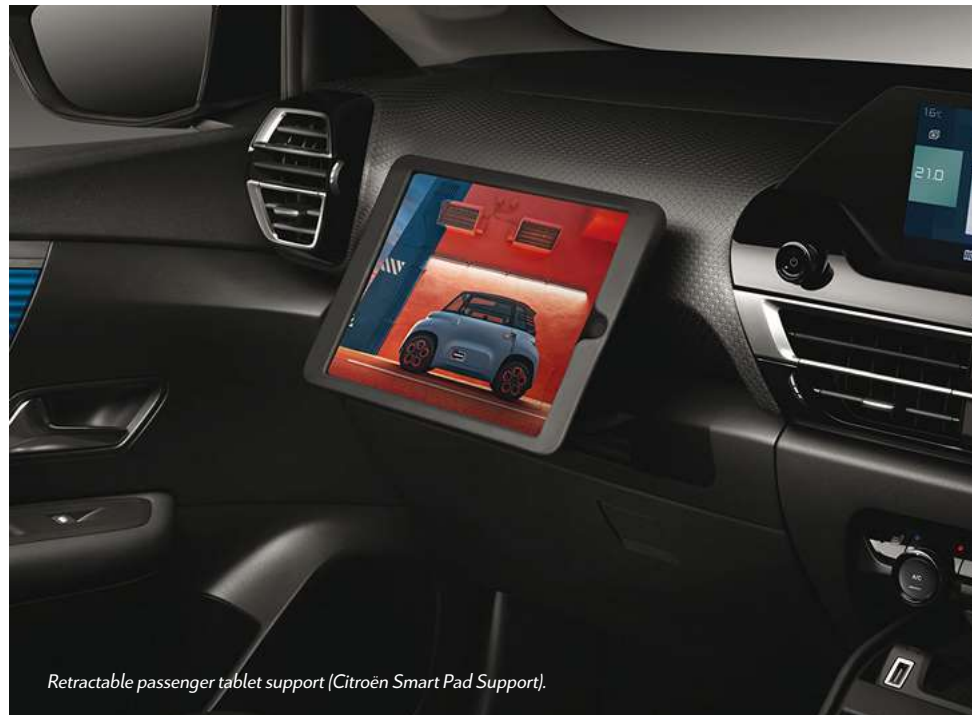
Retractable passenger tablet support (Citroën Smart Pad Support).