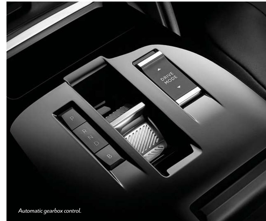
Automatic gearbox control.