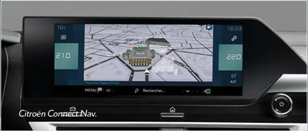
Citroën Connect Nav.