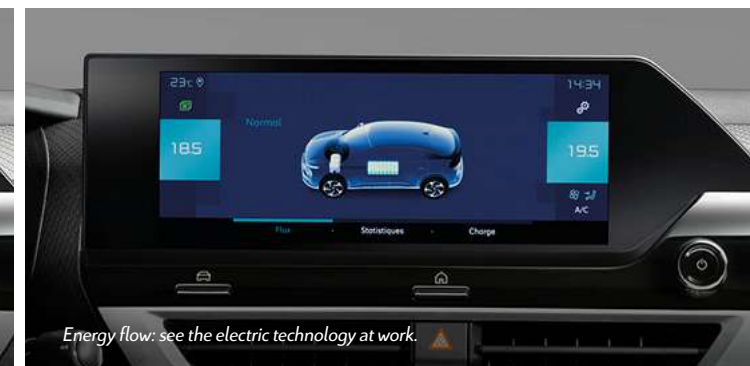
Energy flow: see the electric technology at work.