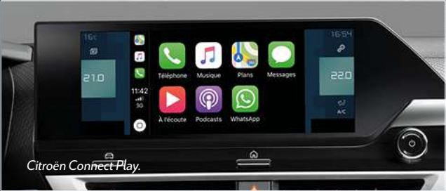
Citroën Connect Play.

With its sleek and modern dashboard, its door trim pads with soft lines and its high and wide centre console, the passenger compartment of New Citroën ë-C4 – 100% electric and Citroën C4 inspires well-being and peace of mind at first sight. The Head-Up Display* helps the driver to remain focused on the road while viewing essential driving information. In the centre of the dashboard, the 10" high-definition touch screen groups together all of the car's controls. New Citroën ë-C4 – 100% electric and Citroën C4 are fitted with 20 driving assistance technologies and six connectivity systems. Among these, Citroën Connect Nav*, a latest-