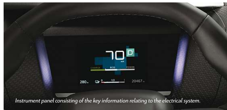
Instrument panel consisting of the key information relating to the electrical system.

of the dashboard display the energy flow and the programming screen for the deferred charging of the battery. When the car is charging, the screen displays the information relating to the charge: remaining charging time, range recovered and charging rate.