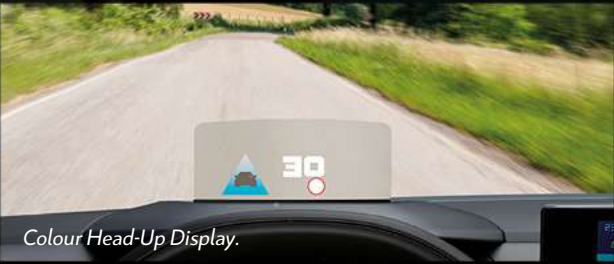
Colour Head-Up Display.

The Highway Driver Assist semi-autonomous driving system combines the adaptive cruise control with Stop & Go function with a system that keeps the vehicle in its lane. The driver then no longer needs to manage the speed or the trajectory, as these functions are controlled by the car.