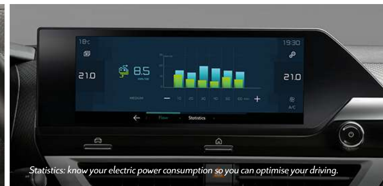
Statistics: know your electric power consumption so you can optimise your driving.