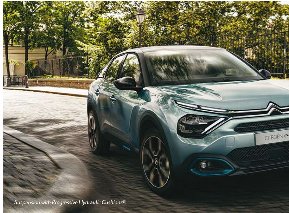
Suspension with Progressive Hydraulic Cushions®.