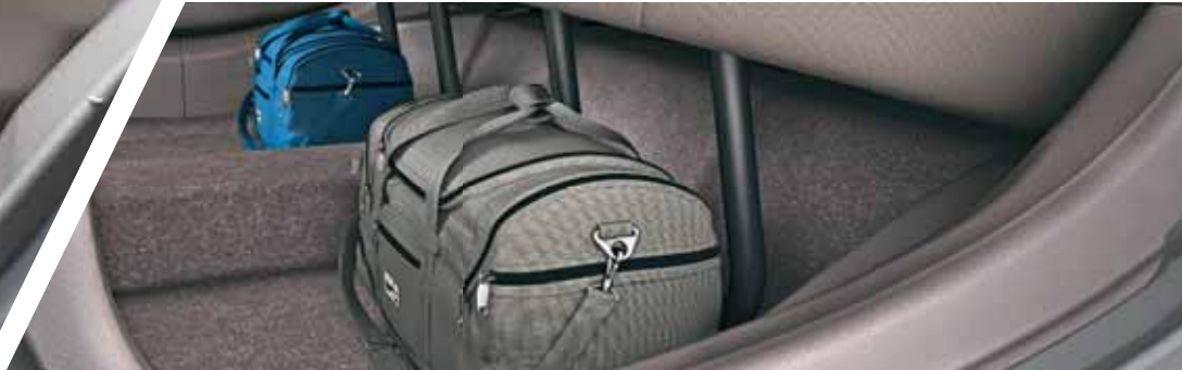
Storage Space under Rear Seat: Helps organise your in-cabin luggage without having to stow it in the boot.