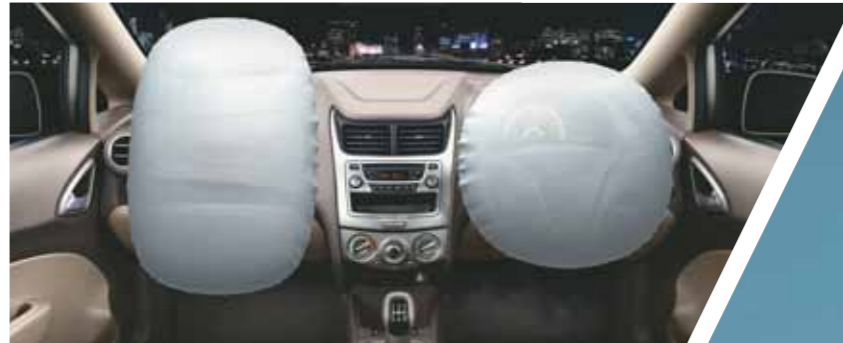
Dual Airbags: Cushion the front seat occupants & provide protection during high speed frontal impact.

The Chevrolet SAIL comes with an unmatched set of active and passive safety features. Its Safe-Cage Design with a 3-point force dispersion structure with in-built crumple zones and side impact beam in doors provides enhanced safety for the cabin occupants. The centrally-located fuel tank fortified by cross-structures is an added protection in case of a side impact. Made of sterner stuff, well it's true.