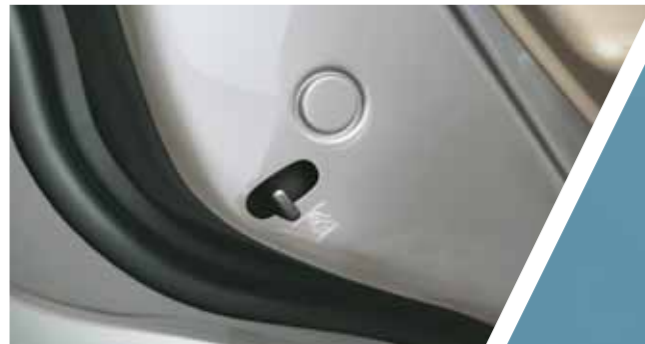
Child Protection Rear Door Locks: Prevent inadvertent door opening to protect your little ones.