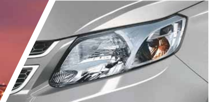
Hawk-Wing Style Front Headlamps: Add a swanky dimension & visual impact of the bold front styling.