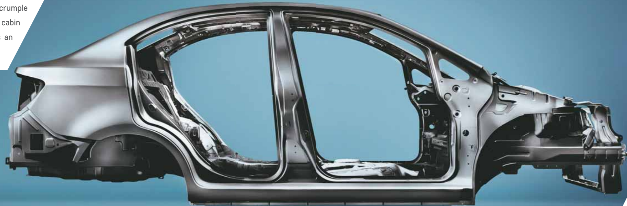
Chevrolet Safe-Cage Design - Cocoon of safety