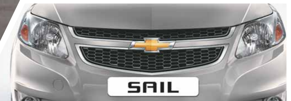
Dynamic Sculpture Design with Bold Front-end Styling: Adds premium appeal to the aggression of the taut and sculpted form.