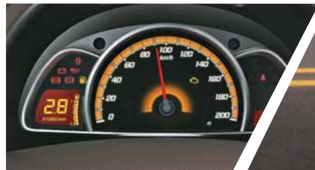
Rising Sun Style Instrument Cluster: With a Digital Tachometer.