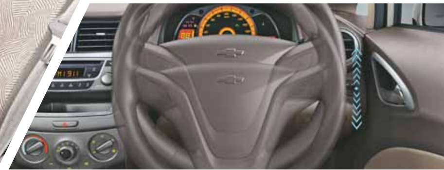
Tilt Steering: For adjusting the steering wheel angle for enhanced driving comfort.