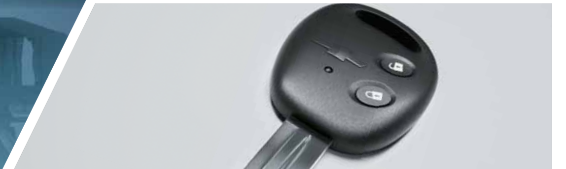
Engine Immobilizer with Remote Keyless Central Door Locking: For enhanced security of your car.