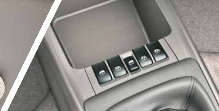
4 Door Power Windows: For comfort and convenience of operating windows at the touch of a button.