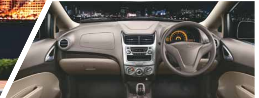
Chevrolet Corvette-Inspired Dual Cockpit design: With wide horizon view dash design enhances functional & aesthetic interior appeal.