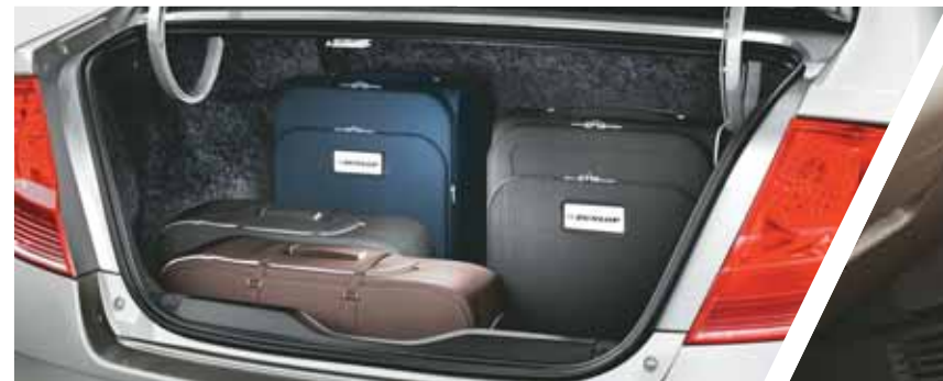
Superior Boot Space: To fit in your world when life gives you more.

Luxurious Comfort and Ergonomic Convenience are in the DNA of the Chevrolet SAIL. Relax in the comfort of well-supported seats, fold-away rear armrest and generous front and rear legroom. Enjoy the drive with the advanced Bluetooth®-enabled Audio Streaming. Sail comfortably over pot-holed roads confident of the Chevrolet Sail's unique suspension set up. Drive off smiling with the speed-sensitive auto locks. Adjust the OSRVs electrically at just a touch of a button. Turn on the tropicalized air-conditioning to enjoy a cool breeze in the harsh summers. This is thoughtful engineering for a rejuvenating driving experience – you will never settle for less.