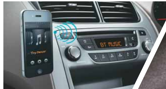
Fun Wide Audio System: Bluetooth® enabled Music Streaming & Mobile Hands-free system transforms your car into a jukebox on the move.