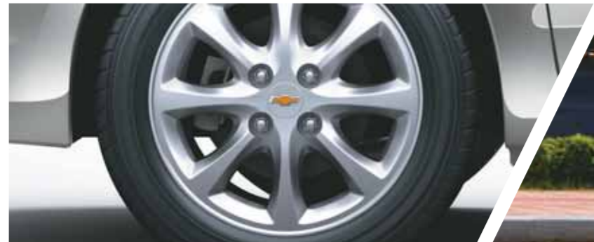
Alloy Wheels: Stylish & sporty 8 Spoke, 14 inch alloy wheels enhance appeal & performance.

The Chevrolet SAIL belongs to those who stand out. An aggressive and macho front styling based on the Dynamic Sculpture Design philosophy, along with its wide stance lends it an unmatched grace and awe inspiring presence. Elegant finish and broad shoulders apart, the muscular physique of the Chevrolet SAIL gets glamour to the grace with its elegant wide-angled jewel-effect tail lamps and wrap around head-lamps. The stunning Chevrolet Corvette inspired Dual Cockpit Interior Design with a refreshing Rising Sun instrument cluster, luxuriously blended two tone interiors with highlights in silver and chrome, define the overall appeal and charm of the Chevrolet SAIL that commands respect and envy both at the same time.