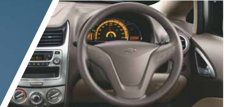
Collapsible Steering: An additional safety feature for driver protection in case of frontal impact.