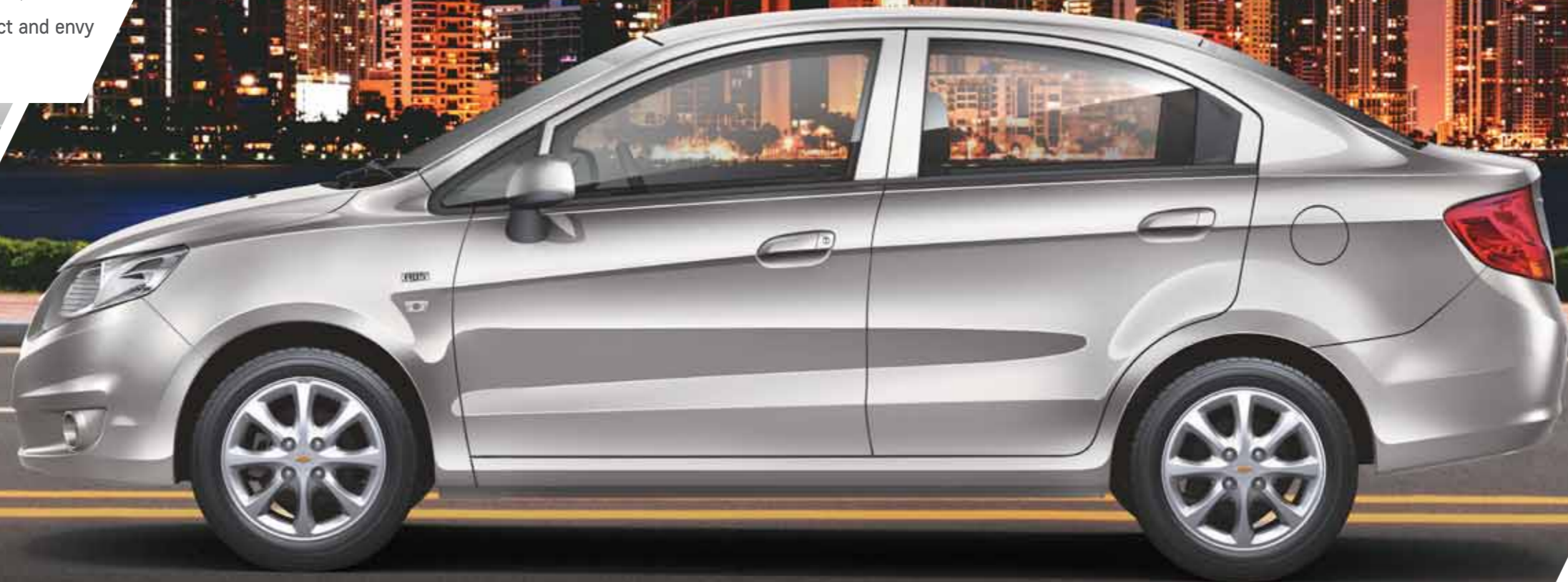
Dynamic Sculpture Design