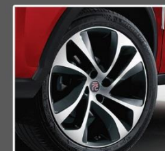
17" ALUMINUM ALLOY WHEEL (FOR DCT VARIANT)