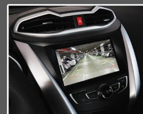
PARKING ASSIST VIEW AND 4 REAR PARKING SENSORS