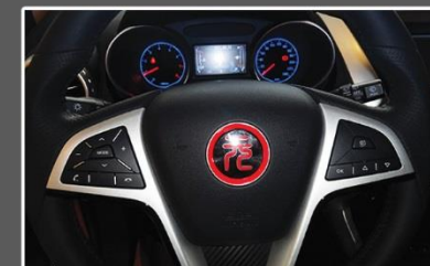
STEERING WHEEL MOUNTED CONTROLS