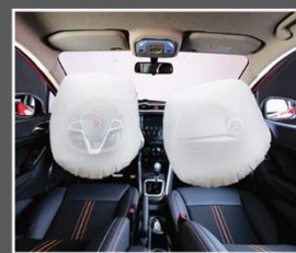
FRONT DUAL AIR BAGS