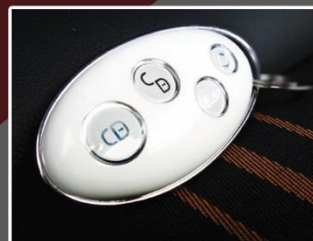
SMART KEY SYSTEM ( REMOTE START, DOORS, ENGINE, TRUNK )