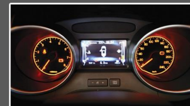
BARREL TYPE LCD COMBINATION DASHBOARD