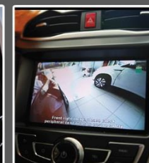
RIGHT SIDE MIRROR CAMERA