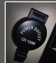
12V REAR POWER OUTLET