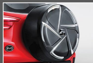
SPORTY TIRE COVER WITH CAMERA