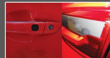
PUSH BUTTON KEYLESS ENTRY DOORS AND TRUNK