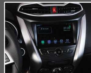
8" ANDROID MULTI-MEDIA SYSTEM