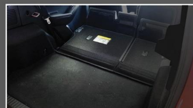
6:4 SPLIT-FOLDING REAR SEATS AND A SPACIOUS TRUNK