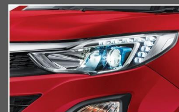
HALOGEN HEADLIGHT WITH DAYTIME RUNNING LIGHTS ( WITH AUTO-RESPONDING HEIGHT ADJUSTMENT & OFF DELAY )