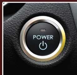
ENGINE PUSH START/STOP BUTTON