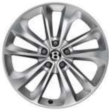
21" FIVE TWIN-SPOKE ALLOY WHEEL PAINTED