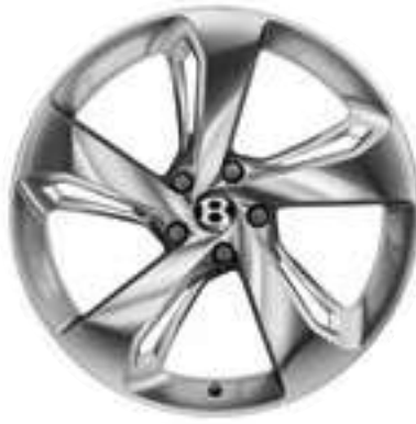
22" FIVE SPOKE DIRECTIONAL ALLOY WHEEL POLISHED