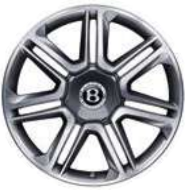
21" SEVEN TWIN-SPOKE WHEEL GREY PAINTED AND DIAMOND TURNED