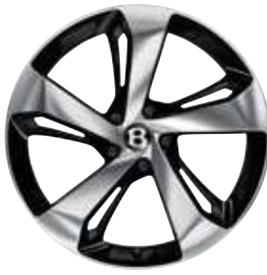
22" FIVE SPOKE DIRECTIONAL ALLOY WHEEL PAINTED AND POLISHED