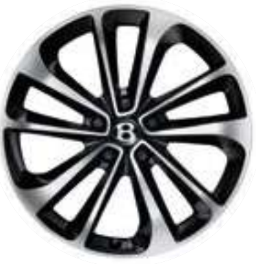
21" FIVE TWIN-SPOKE ALLOY WHEEL BLACK PAINTED AND DIAMOND TURNED