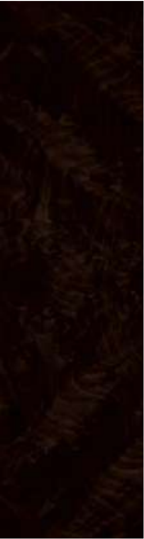
Dark Stained Madrona