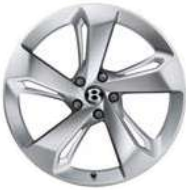
22" FIVE SPOKE DIRECTIONAL ALLOY WHEEL PAINTED