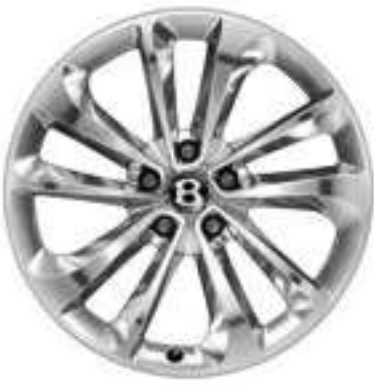
21" FIVE TWIN-SPOKE ALLOY WHEEL POLISHED