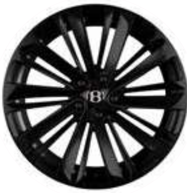
22" SPEED TEN SPOKE ALLOY WHEEL BLACK PAINTED