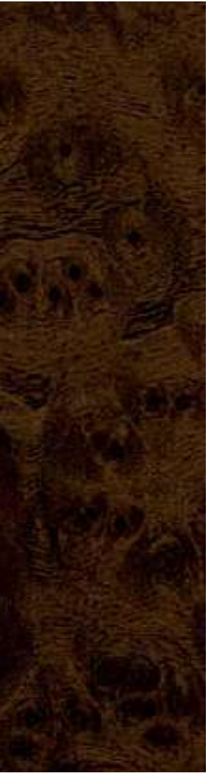
Dark Stained Burr Walnut