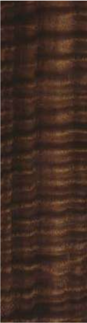
Dark Fiddleback Eucalyptus