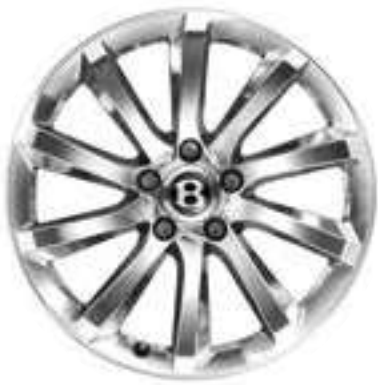
20" TEN SPOKE ALLOY WHEEL POLISHED