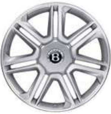
21" SEVEN TWIN-SPOKE WHEEL PAINTED