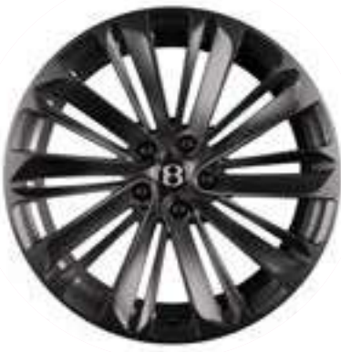
22" SPEED TEN SPOKE ALLOY WHEEL DARK TINT