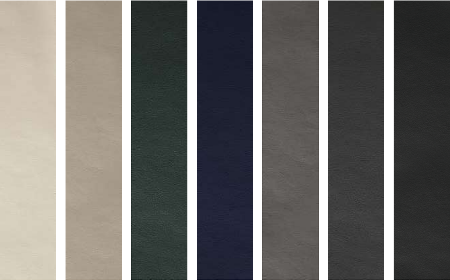
Linen Portland Cumbrian Green Imperial Blue Porpoise Brunel Beluga