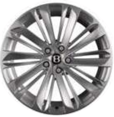
22" SPEED TEN SPOKE ALLOY WHEEL SILVER PAINTED