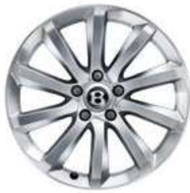
20" TEN SPOKE ALLOY WHEEL PAINTED

A stunning new 22" Speed wheel in a dynamic ten spoke design with a refined, sporting look is available in three finishes, exclusively for Bentayga Speed.