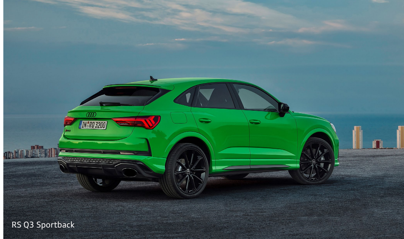
RS Q3 Sportback

It's packed with comfort and innovative technology like the MMI navigation plus that provides exact navigation instructions at the touch of your fingertips and a crisp Bang & Olufsen sound system for epic road-trips. The RS sport exhaust delivers the final word, providing a dynamic look and distinctive sound.